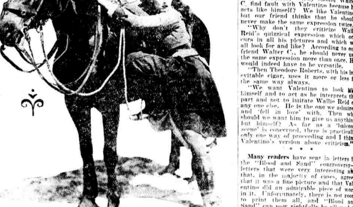
"Under Two Flags" has again been filmed, this time with Priscilla Dean as Clarette, the heroine. Above is a scene showing Clarette alone after the wedding is absolutely inconceivable to me.

Concerning Doris Keane Doris Keane, star in "The Czarina," appearing at the Broad, Monday, became an actress because nothing else really interested her.