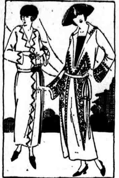
Poiret Twill $25.00 Poiret Twill $22.50

Afternoon Dresses—$35.00 to $47.50 The more elaborate models, of Canton crepe, crepe Roma, satin-faced crepe and chinchilla satin; graceful draped effects (one model sketched), and artistically embroidered and beaded models. Brown, navy blue and black.