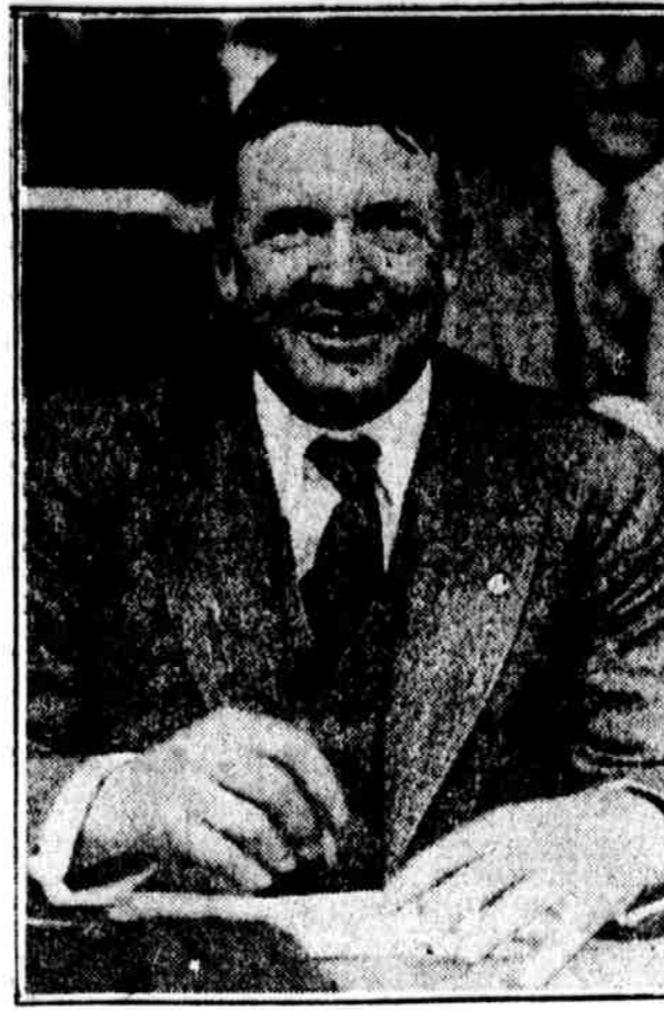
"BIG SIX" KEEPING SCORE. Christy Mathewson, seeing his first big league game in three years, MET ON THE POLO GROUNDS IN NEW YORK, as the first game of the 1922 World Series was about to start.