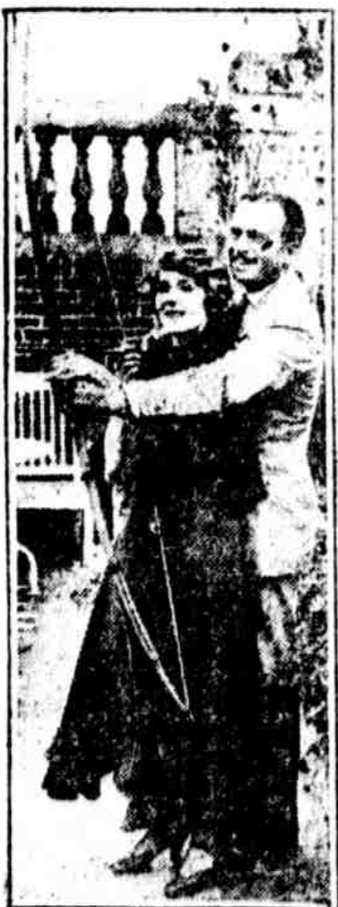
"DOUG" SHOWS FRIEND WIFE how to become an expert archer. Mr. and Mrs. Douglas Fairbanks arrive in New York from the West