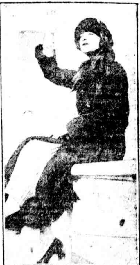
MISS FANNY BRICE, former "Follies" girl, who is back from an engagement in London