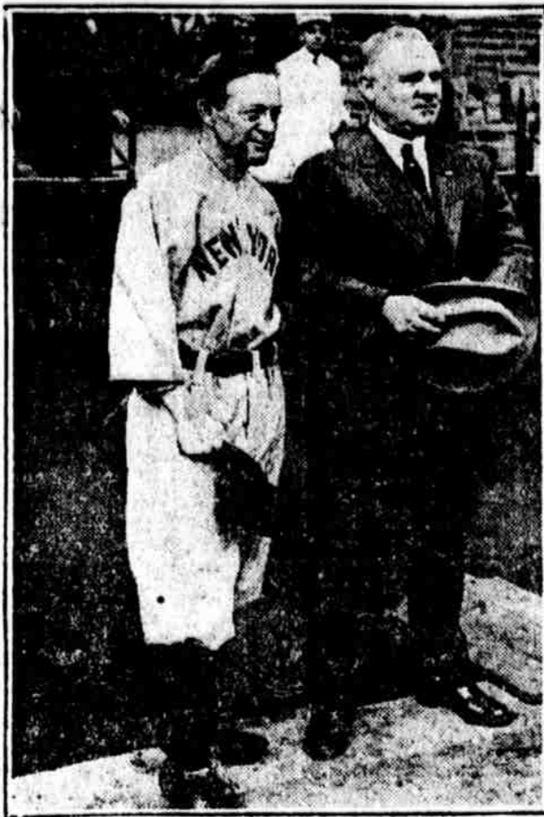
OPPOSING MANAGERS. Miller Huggins (left), of the Yankees, and John McGraw, of the Giants, met on the Polo grounds in New York, as the first game of the 1922 World Series was about to start.