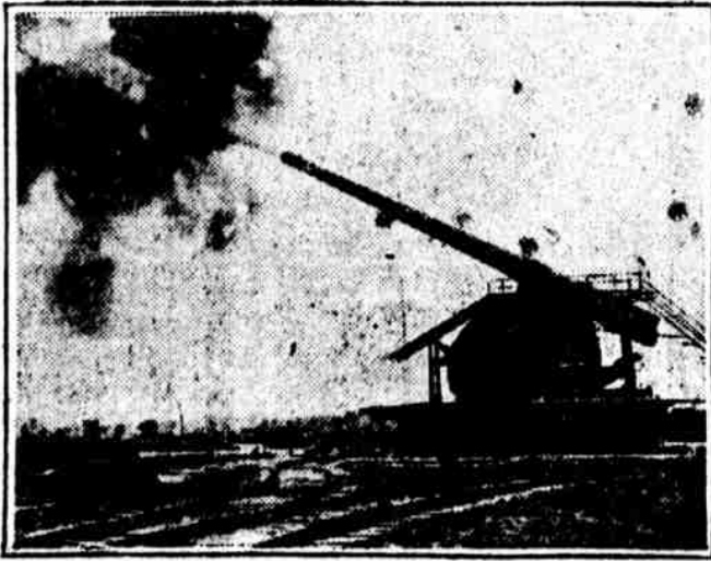
ONE OF THE BIGGEST GUNS IN THE WORLD firing a shell weighing over a ton to a range of about thirty miles at the Aberdeen proving ground in Maryland