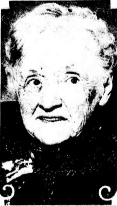
MRS. W. H. FELTON First of her sex to be a member of United States Senate, temporarily appointed to succeed the late "Tom" Watson, of Georgia. She admits she does not aspire to honors in statesmanship.

man must have a living wage. He must not be forced too much in competition with unskilled labor from abroad. There must be every encouragement.