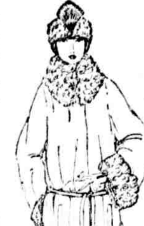
The coat pictured is of bolivia cloth most effectively trimmed with fur cloth. This fur cloth looks like cashmere and is used to make the luxurious collar, cuffs, the side panels and deep border. Silk lined, too, all for $25.