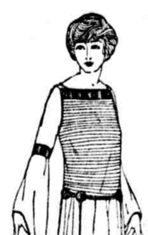
A beautiful satin-back crepe dress with lace-like insertions of braid designs and with long flowing sleeves and long floating panels and an interesting braided belt of the same silk, at $35.