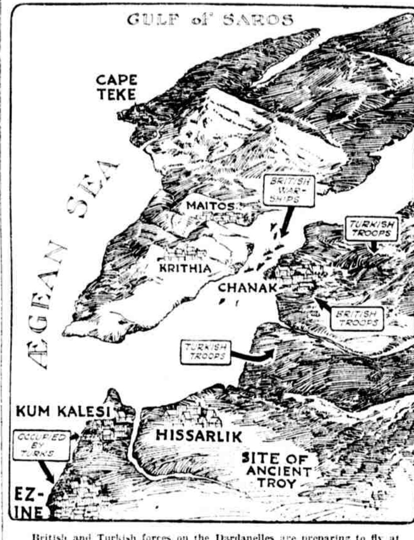
British and Turkish forces on the Dardanelles are preparing to fly at each other's throats if peace efforts fail. British forces are concentrated at Chanak and are supported by dreadnoughts in the Dardanelles. The Turks hold Kung Kalesi at the mouth of the Straits and have advanced forces both sides of Chanak, flanking the British