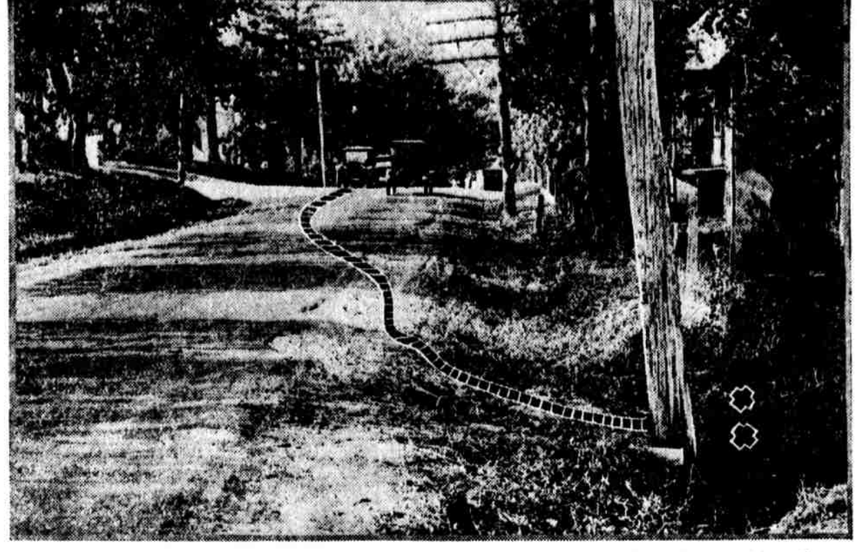
Line shows course taken by machine which hit pole resulting in death of girl and man. Two others