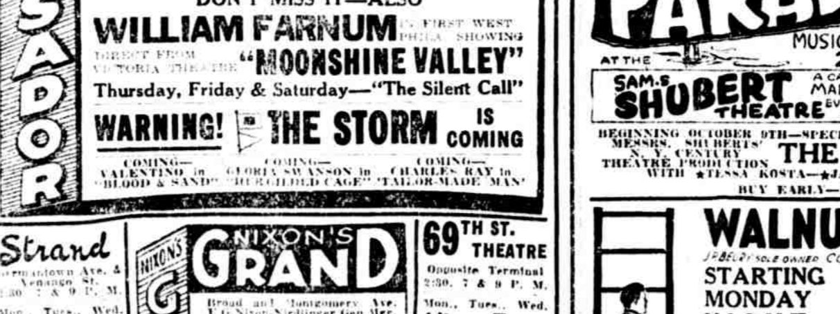
LENNOX PAWLE, MARJOLINE, "Up the Ladder" Walnut