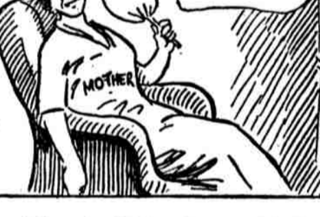
Shifting the Responsibility