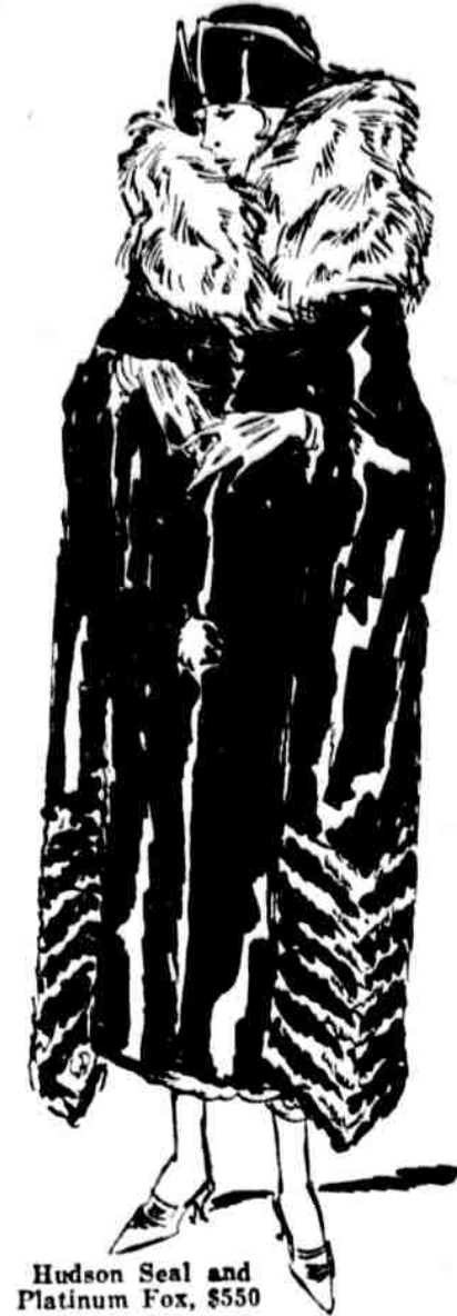
Hudson Seal and Platinum Fox, $550

And nothing you buy today or tomorrow gets charged on your August bill.