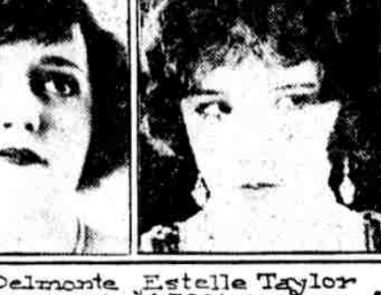
BATHING BEAUTIES BEAUTY REVUE" A FOOL THERE WAS CASINO

Photoplays to Be Seen on Local Screens Soon