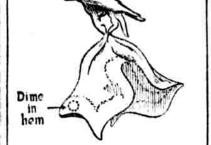
No. 248—The Dime and Handkerchief

A borrowed dime is wrapped in a handkerchief. A spectator holds the dime through the cloth. Suddenly the performer shakes out the handkerchief. The dime has disappeared. A handkerchief with a broad hem must be used with a dime previously sewn in the hem. In placing the borrowed dime in the handkerchief the performer really retains it in his hand, but allows the spectator to feel the dime that is in the hem, which is folded inside the cloth. To make the dime "disappear," the performer simply takes one corner and shakes out the handkerchief.