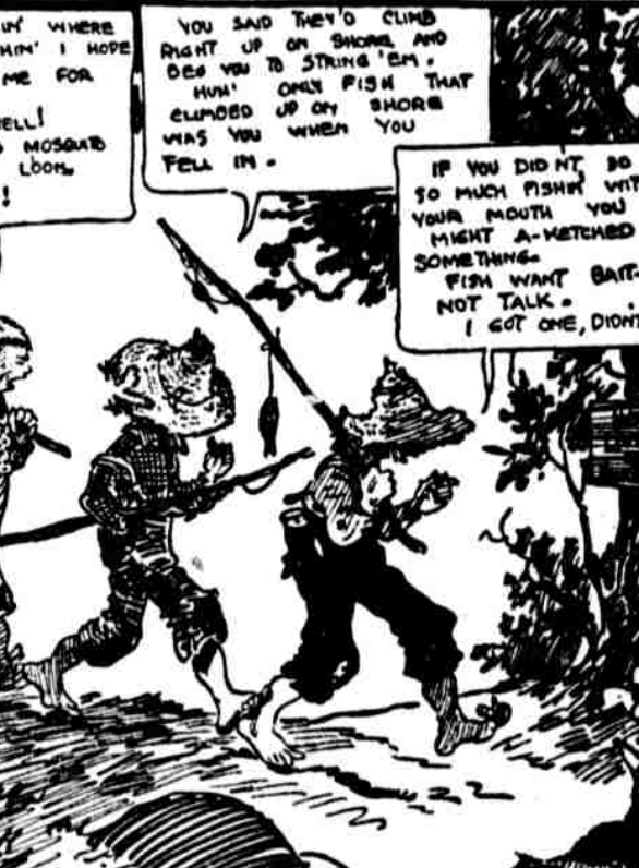
JUST AS THE SUN WENT DOWN..