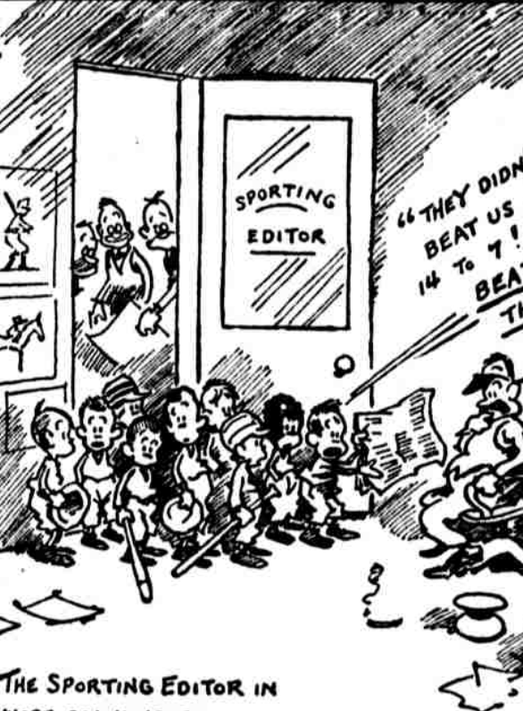
THE SPORTING EDITOR IN WHOSE COLUMNS THE SCORE OF THE GAME BETWEEN THE LITTLE GIANTS AND THE YOUNG TIGERS APPEARED ALL TURNED AROUND.