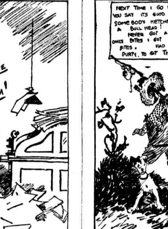
JUST AS THE SUN WENT DOWN..