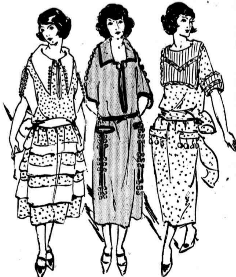
Misses' Dress Now $5—Was $15 Misses' Dress Now $5—Was $15 Misses' Dress Now $5—Was $15

—Gimbels, Balcony of Dress, Third floor.