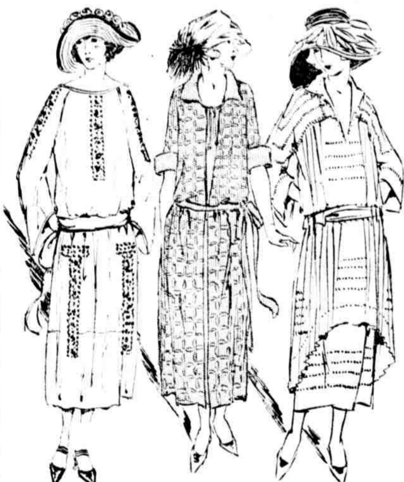
Women's Dress Now $5—Was $15 Women's Dress Now $9—Was $25 Women's Dress Now $11—Was $29.75

Beginning With $7.50 to $25 Dresses Reduced to $5