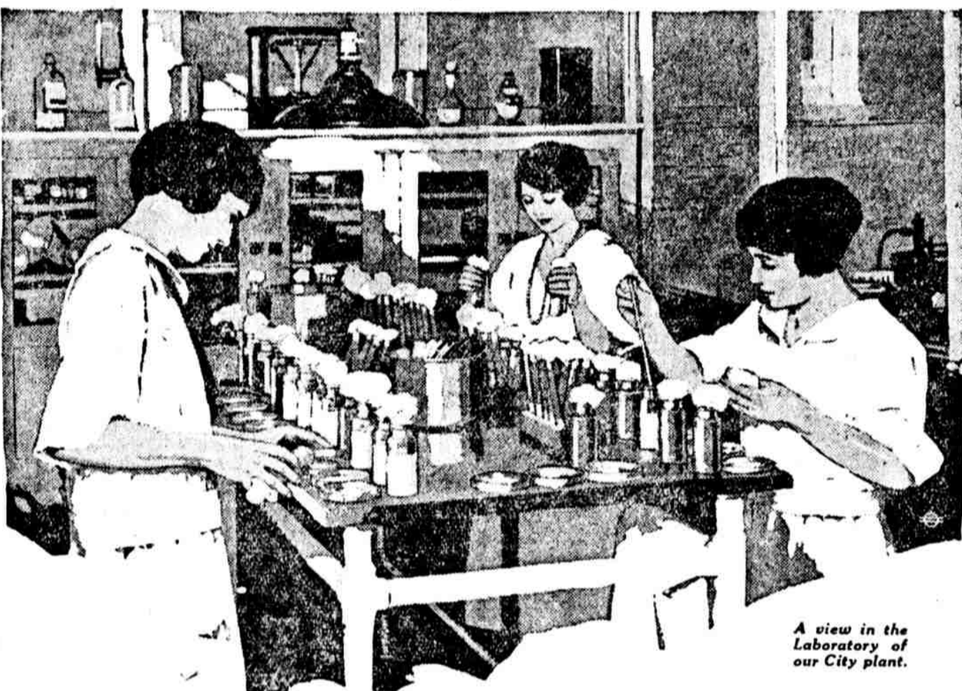
A view in the Laboratory of our City plant.

Men's Sport Oxfords Now $4.50 Good, heavy quality smoked elk oxfords with brown trimmings. Fiber suction soles and heels adapted to sports wear. All sizes and widths. (Men's Gallery, Market)