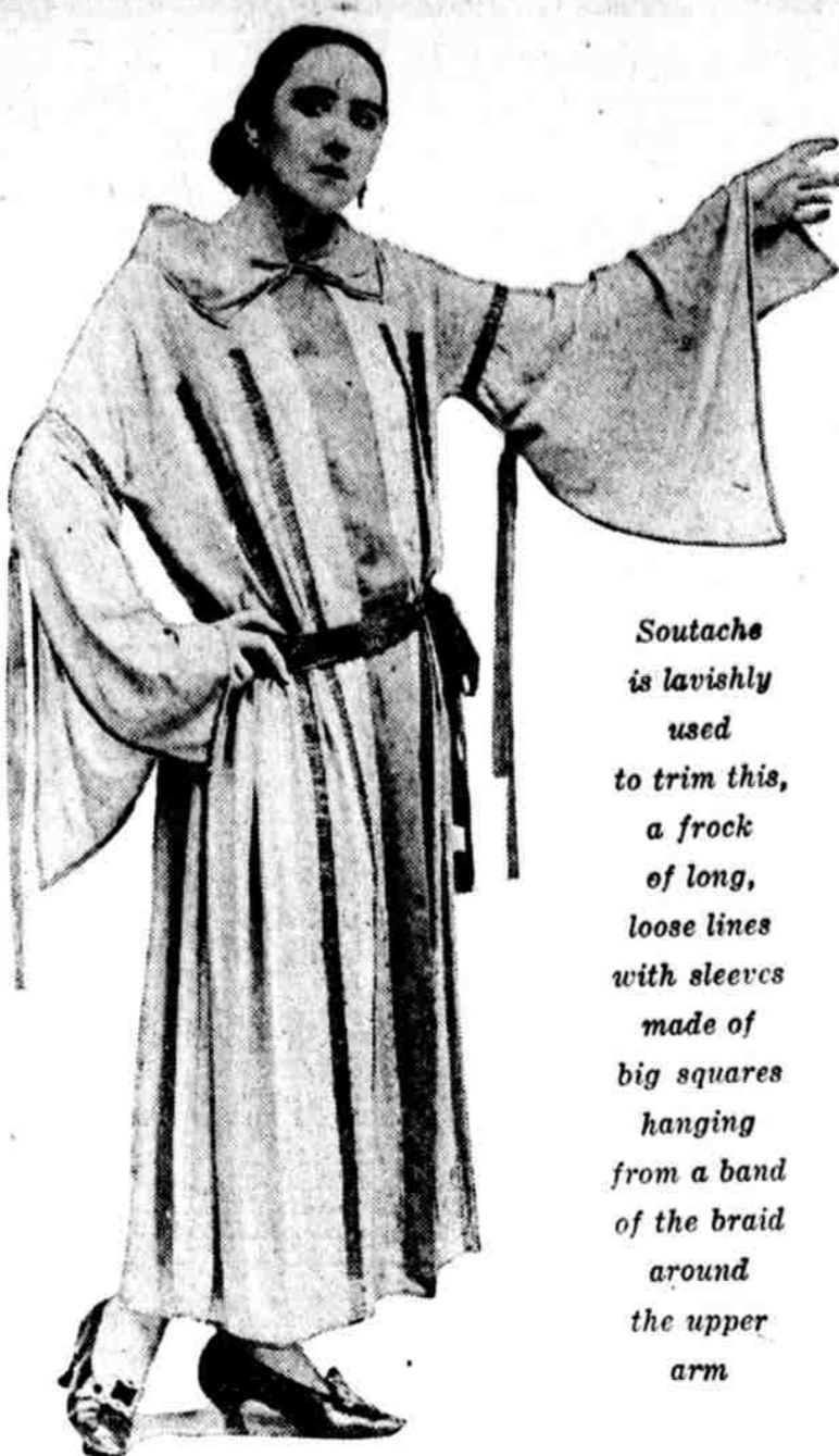
Soutache is lavishly used to trim this, of long, loose lines with sleeves made of big squares hanging from a band around the upper arm

ARE we amateurs and dolts at the love game? Is it necessary to go to France to learn the gentle art of anatomy expression? In the indictment a woman that does not begin to compare with continental ones in holding their husbands' affections? One American girl, a great opera singer, has gone to Paris to ascertain how to love. She has not even secured one! She certainly is foresighted! Also, if her big aim in life is to be a solitaire, a husband is a waste of a good coin in giving her an expensive musical education. Women geniuses may be perfectly good wives, but they are apt to be too smart with their wits to be awake nights brooding over ways and means to recapture their errant spouse's fancy. The Paris "expert" in Cupid's art claim that we are cold and selfish and egoistic, and do not know anything about the real dyed-in-the-wool passion that drives a man crazy, and holds him in thrall. They say that we are cold and selfish and egoistic, and do not know anything about the real dyed-in-the-wool passion that drives a man crazy, and holds him in thrall. They say that we are cold and selfish and egoistic, and do not know anything about the real dyed-in-the-wool passion that drives a man crazy, and holds him in thrall.