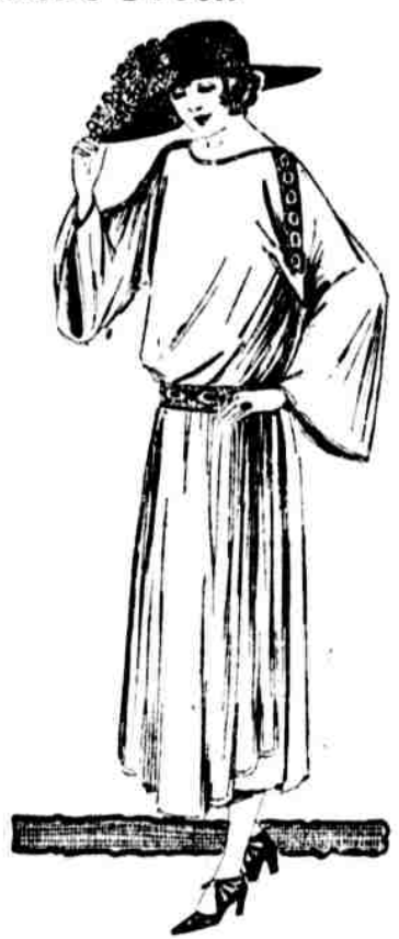
Sizes 14 to 20 years, $30 to $98. (Second Floor)

Silk crepes are the favorites, many of the most exclusive dresses being of satin-faced crepe. Sable brown leads, but navy and black are decidedly good. What few touches of adornment there are fall into three classes: made of self material, contrasting beads used sparingly, and girdle clasps.