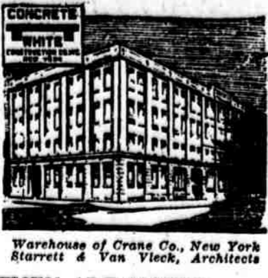
Warehouse of Crane Co., New York Street & Van Vleet, Architects

To Eliminate Grade Crossing Officials of the Old York Road Chamber of Commerce have been advised the Reading Railway would construct an overhead bridge to eliminate the dangerous crossing at Chelton Mills Station, south of Jenkintown. It is said the survey has been made. It is believed the bridge will cost between $150,000 and $200,000, and that work will be started late this year or early next year.