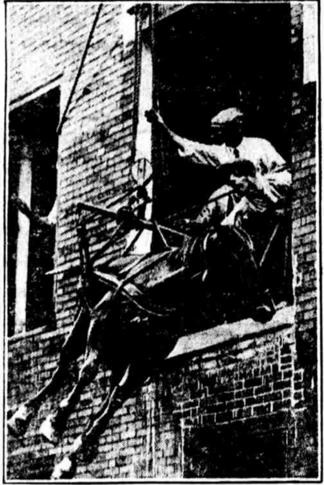
WALKED UPSTAIRS— Block and tackle brought horse down. This horse was tied in his stable, rear of 606 South Hancock street. When the owner returned he found the horse one flight up.