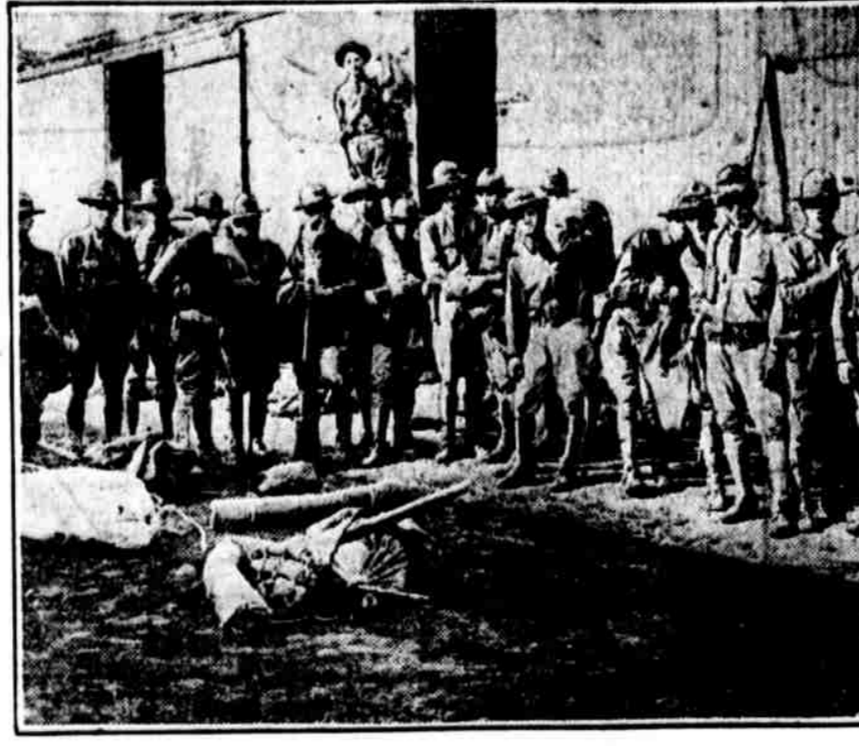
SCENES IN THE PENNSYLVANIA RAILROAD YARDS AT HARRISBURG, when four troops of the 104th Cavalry Regiment entrained for Western Pennsylvania coal-strike zone. Box cars were filled with equipment and provisions, while the horses were loaded in cattle cars.