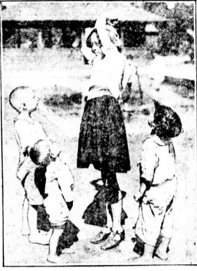
SHOWING THEM HOW IT'S DONE. A West Philadelphia girl winds up and tells the youngsters a few things about tossing 'em over the place.