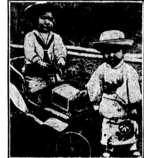
GRANDSONS OF JAPAN'S NOTED STATESMAN. They are playing in the garden of their grandfather, Baron Kato, the new Premier of Japan.