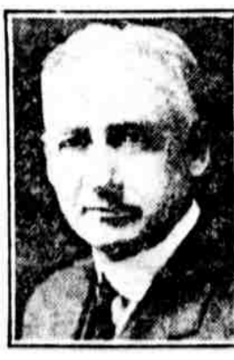
JUDGE MCKENZIE MOSS, Kentucky, new Deputy Commissioner of Internal Revenue.