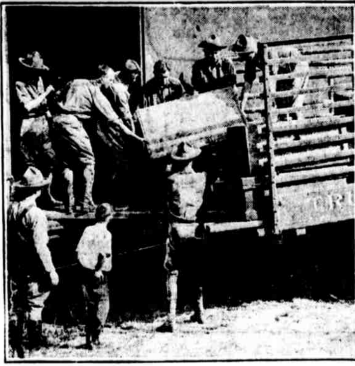
FIRST CITY TROOP LOADING EQUIPMENT. Members of that organization were put to work early yesterday morning.