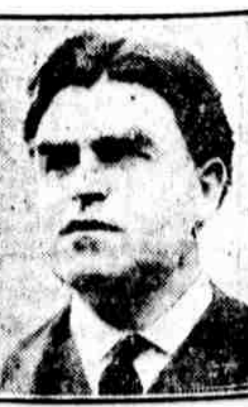
MAYORS of Pennsylvania urge John L. Lewis, head of mine workers, to order men back.