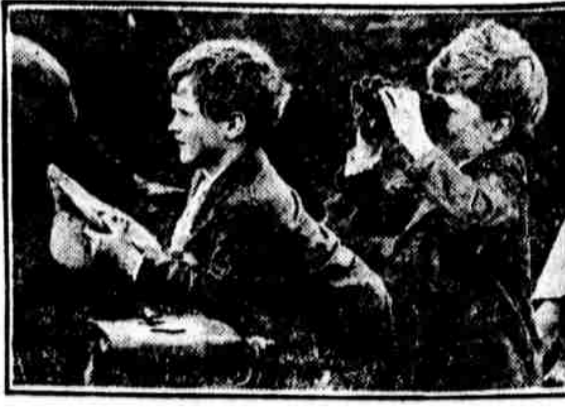
WATCHING DADDY. Two enthusiasts keep close tab on dad's prowess with the rifle at Bisley, England.