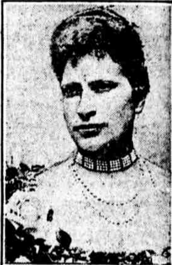
DOWAGER QUEEN LOUISE of Denmark, who has been seriously ill with pneumonia.