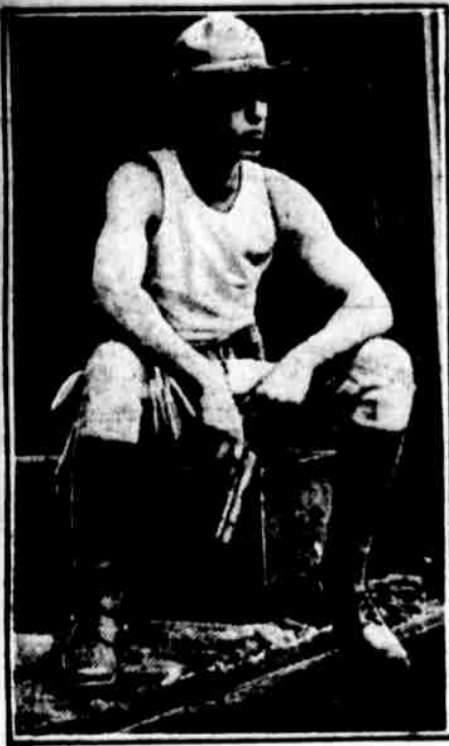
ON GUARD. This member of the 104th Cavalry headquarters company is sitting in a box car.