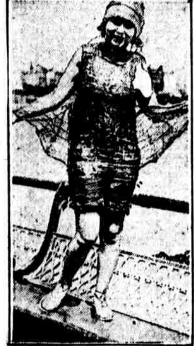
HOW DO YOU LIKE IT? An English bather wearing a novel suit at Brighton Beach