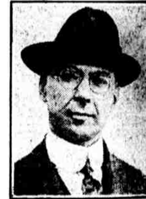
SIR RICHARD SQUIRES is going to England for vacation. He is Prime Minister of Newfoundland