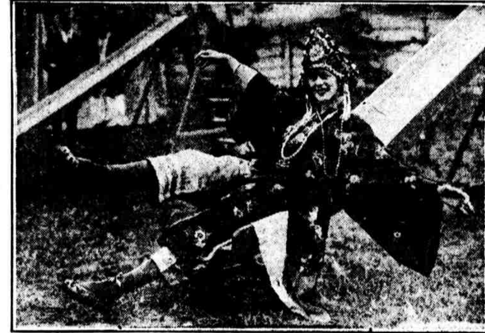
HOW ANITA TOOK THE SLIDE. "Gracefully" is right. Miss Anita Stewart, film star, attended a Chinese fete given by society women at Bay Shore, Long Island