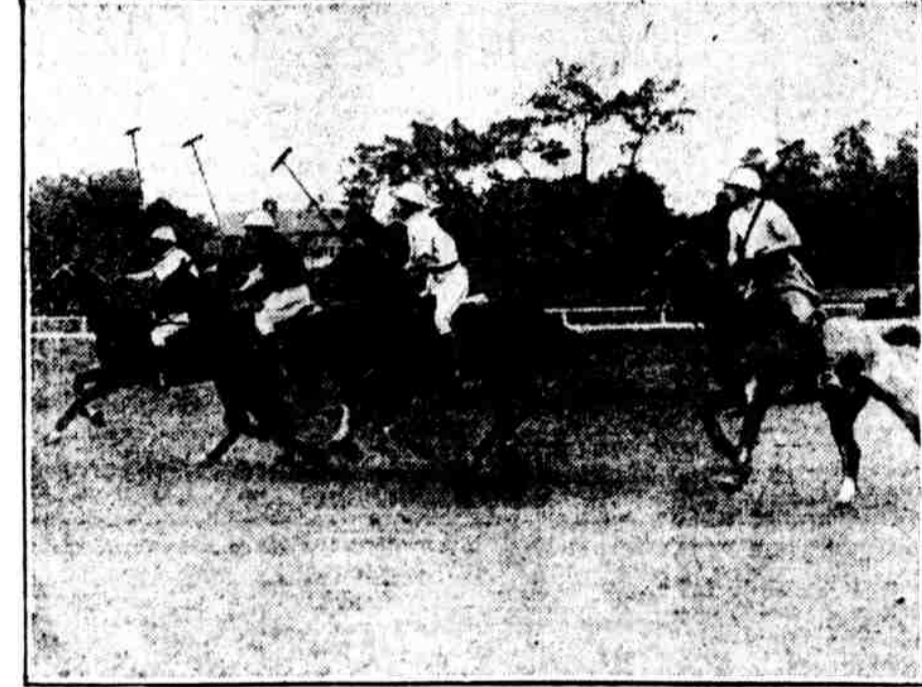
SPEEDING AFTER THE BALL. The Bryn Mawr polo four journeyed to Rumson, N. J., to meet the Rumson Country Club polo team