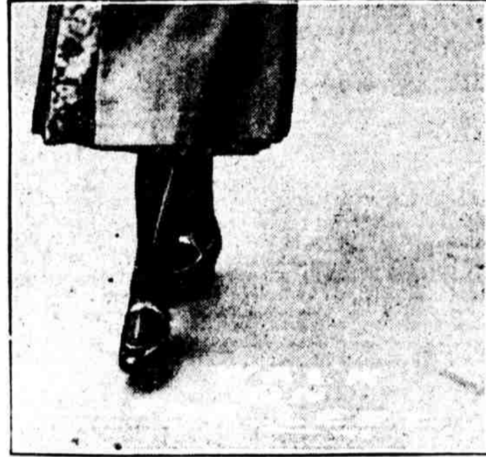
GET ON THE RIGHT SIDE AND STAY THERE. But the right side of London sidewalks is the left side. A crusade is on to regulate pedestrians