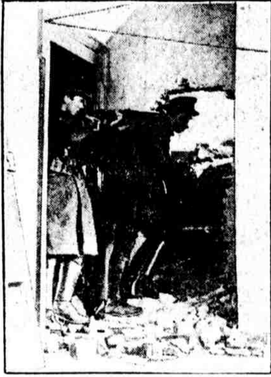
FREE STATE RIFLEMEN used a hole in the wall of an unoccupied building in routing snipers. The building was damaged by gunfire