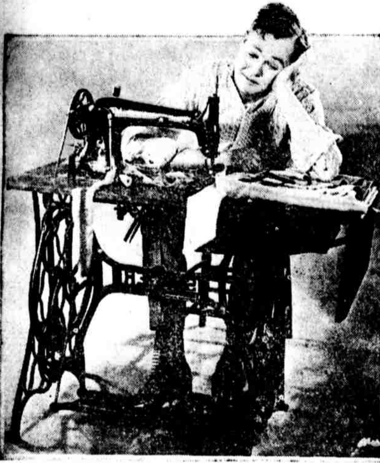
Above is a scene from "The Tailor Made Man," in which Charles Ray makes his bow as head of his own company. You may remember that this year concerns a "poor but honest" young chap in a lower New York shop who, through his ability to dress, breaks into society.