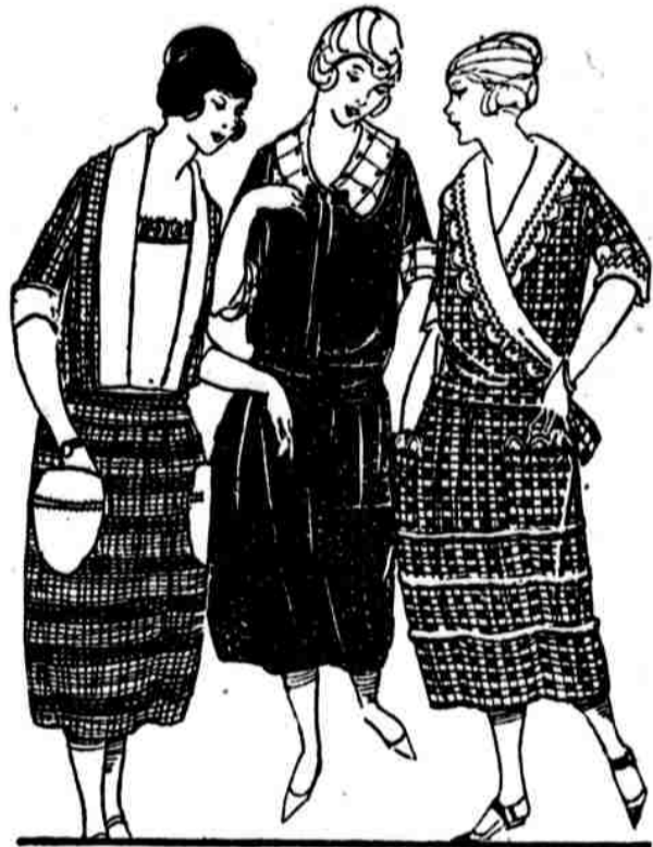
$5 $8 $7

At any one of these prices one can choose from a number of different styles, materials and colorings!