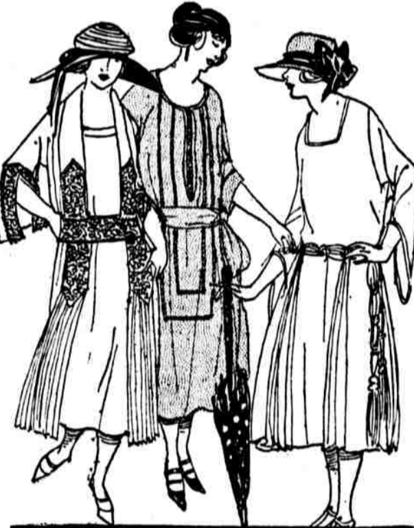
$20 $12.50 $25

Charmingly colored and knitted of glossy fiber silk. Now $25, $30 and $37.50.