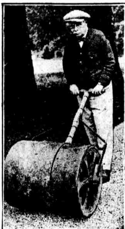
WHY NOT COPY his plan for reducing? John Philip Sousa keeps fit by pushing the roller