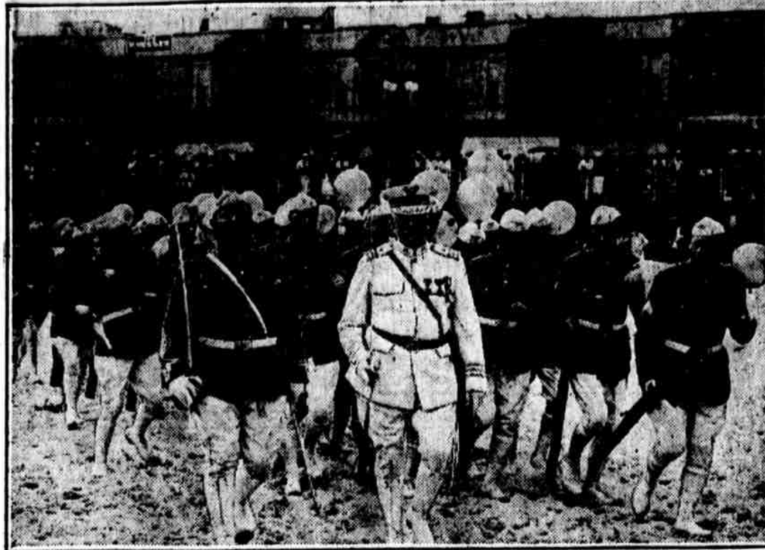
LOYAL VETERAN CORPS OF PHILADELPHIA LODGE NO. 2 ON THE SANDS