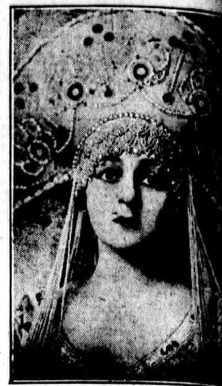
PAULAE ERZSI, who is considered one of the most beautiful women on the European stage, wearing a spectacular headgear