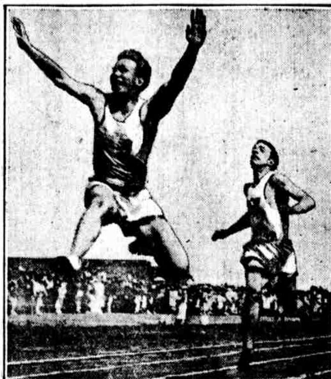
SNAPPED ON HIS BUSY DAY. Charlie Paddock making a flying finish. He broke five world's records at Santa Barbara, Calif.