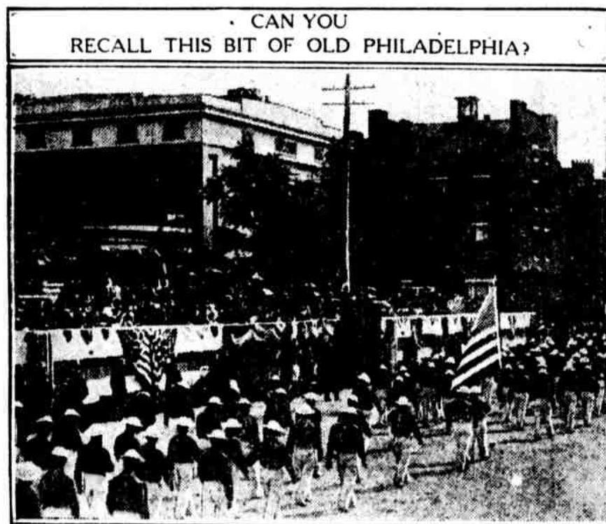
CAN YOU RECALL THIS BIT OF OLD PHILADELPHIA?