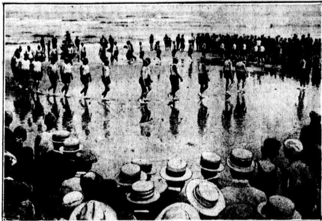
PHILADELPHIA ELKS PUT ON THEIR BATHING SUITS FOR A BEACH DRILL