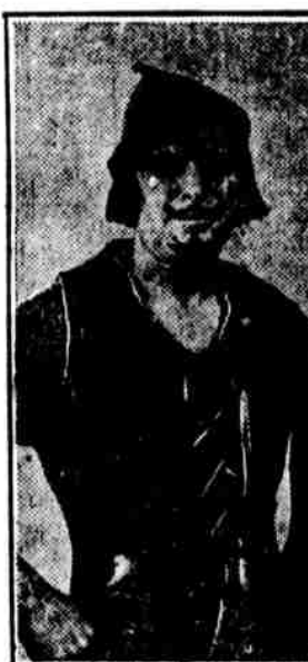
DOUGLAS FAIRBANKS was at work in "Robin Hood" when John Drew called on the movie star at Los Angeles. Mr. Drew, when the same age as "Doug," portrayed same character on the stage