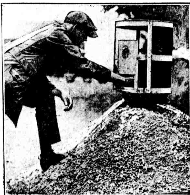
THE JAPANESE BEETLE VS. THE GOVERNMENT. Two scenes at the experimental station at Riverton, N. J., where authorities are waging war against the alien insect pest. At the left is shown a cage in which the ravages of the beetle upon vegetation are observed; at the right a poisonous solution is being sprayed upon infected fruit trees