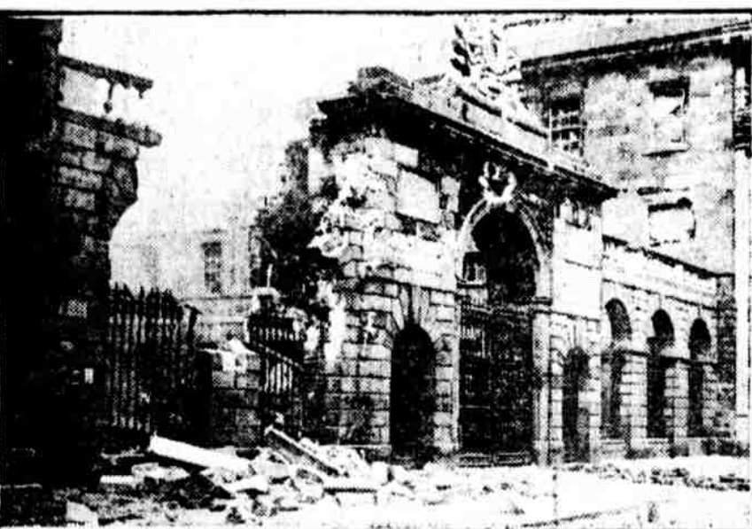
CIVIL WAR DESTRUCTION IN DUBLIN. The battle waged by the Free State troops to drive the Republicans out of the Four Courts lasted several days. Note the damage done to the gateway