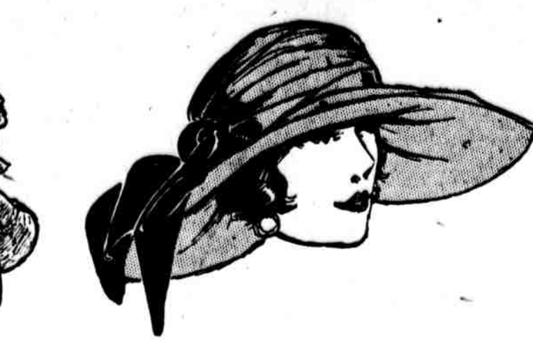
Black Taffeta and Black Velvet- $10.50 wide droop-brim— Gimbels, French Room, Third Scor.