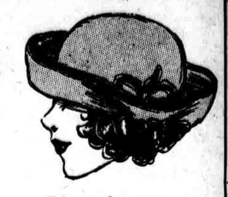
Felt ready-to-wear Sports Hats—the soft kind you pull every which way. All colors except white. Value $1.50