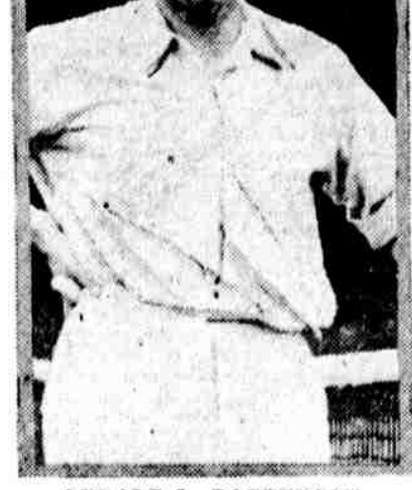
Australian star who lifted Tilden's crown at Wimbledon today, beating Randolph Lycett, Great Britain, in straight sets

Wimbledon, July 10.—Play today on the center court of the stadium saw the crowning of Gerald L. Patterson, Australia, as world tennis champion and the second straight-set defeat of Mrs. Molla Mallory by Mile. Suzanne Lenglen.