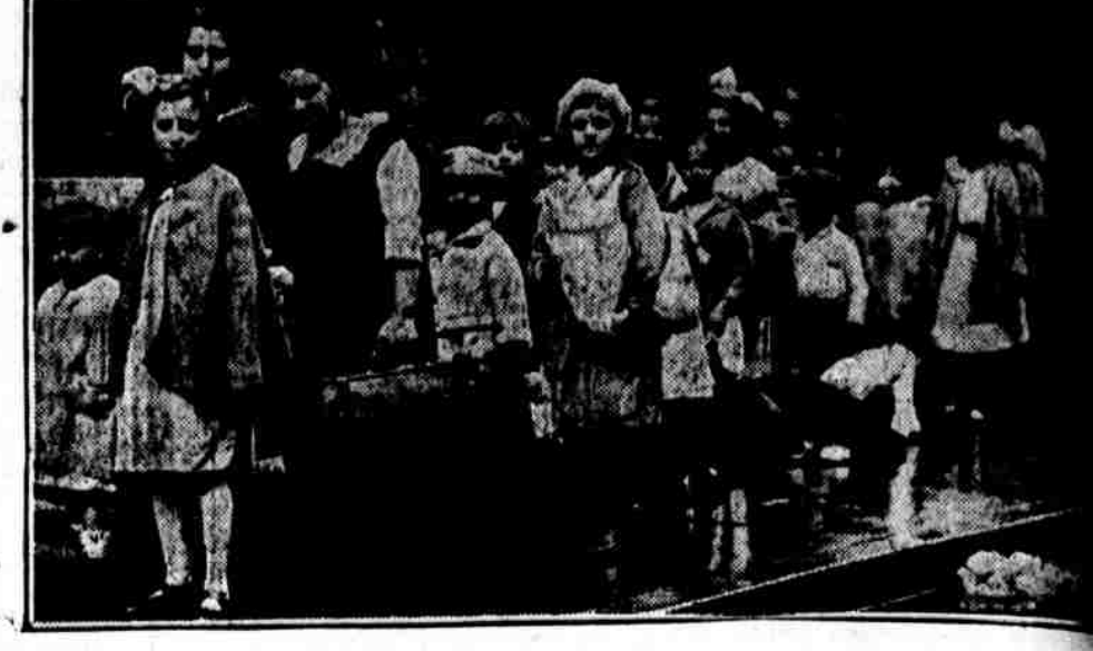
OFF FOR A DAY'S ENJOYABLE OUTING. The children are leaving the Bedford Street Mission, at 619 Kater street, for Clementon, N. J. It was a happy group