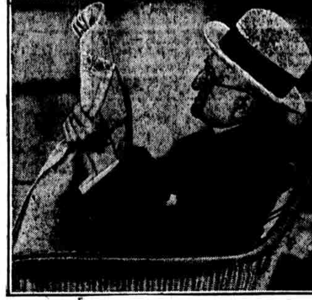
CHAUNCEY M. DEPEW resting at Hot Springs, Va. He looks fit at eighty-eight, and retains an active interest in the world's affairs