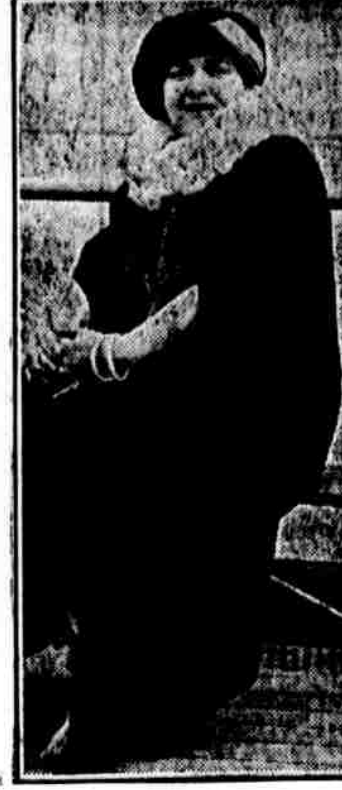
HOME ON 4TH OF JULY. Fannie Hurst, the writer, arrives in New York after European vacation