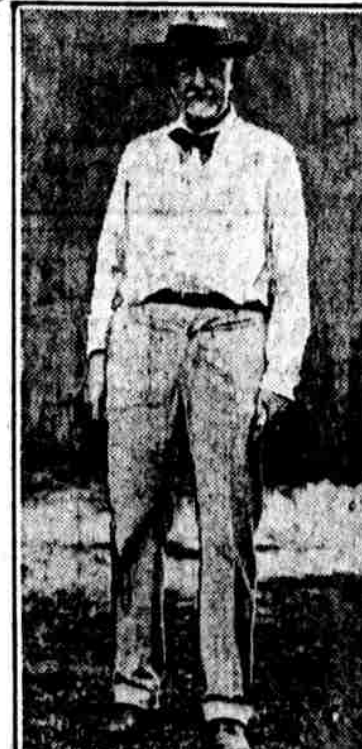
UNITED STATES SENATOR KELLOGG on a Washington golf course. He's good