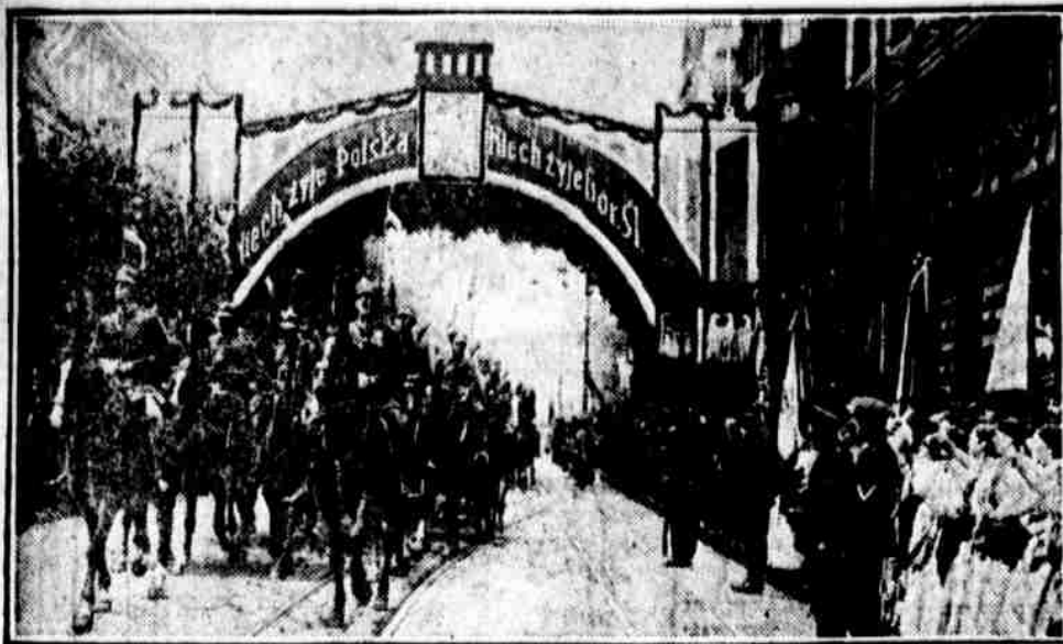
CARRYING OUT A PROVISION OF THE SILESIAN PLEBISCITE. Polish troops, on June 20, crossed the frontier between Poland and Upper Silesia and took possession of the large city of Kattowitz, the center of the Upper Silesian mine district