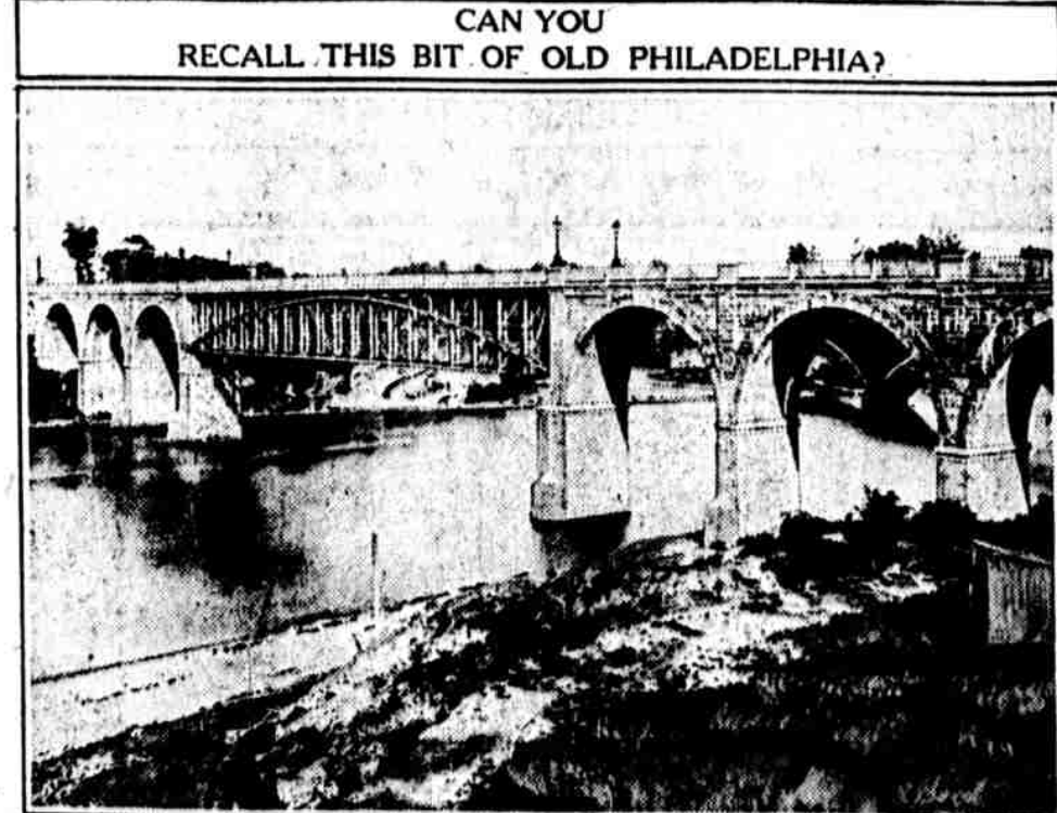
HAVE YOU CROSSED IT? The old W., N. Y. & P. R. R. bridge over the Schuylkill north of Girard avenue. It was removed several years ago. The photograph was made in 1897. Send your old-Philadelphia photographs to the EVENING PUBLIC LEDGER