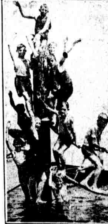
NINE GOOD SWIMMERS pose on one of the safety poles