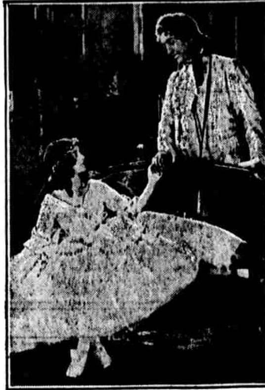
GEORGES CARPENTIER as a "movie" actor. The light-heavyweight champion will appear in "Love's April," now being filmed in Paris