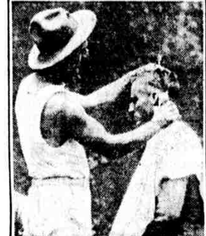
GETTING READY FOR VIRGINIA. Busy with clippers as Marines prepare to leave Gettysburg for Quantico