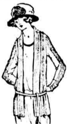
$4.95—Tuxedo model of fibre silk, tailored, in colors and white.