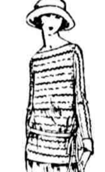
$4.95—Drop stitch Shetland wool, in white with colored stripes.