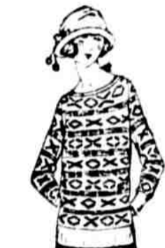
$4.95—Slip-on of light-weight wool, Indian design in gay colors.

An unusual array of fine quality sweaters, at a price that makes this a real event. They are in light, medium, and heavy weights; plain, ribbed, and drop stitch effects.