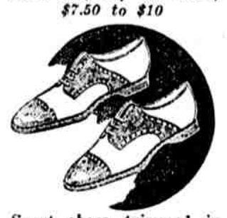
Sport shoes trimmed in patent, carmine red, fawn or gray, $6.50 up