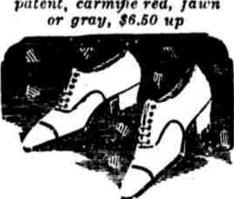
The most comfortable smart oxfords in town, from $6.50