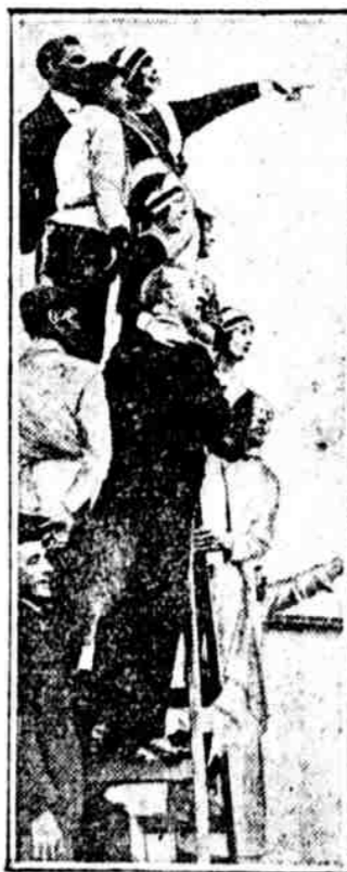
ENGLISH waitresses and butlers pick out a good spot to see the Ascot races