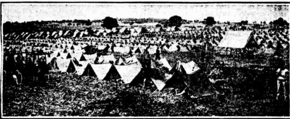
FIVE THOUSAND MARINES AT GETTYSBURG. The tents are pitched on the historic battlefield, where a duplication of General Pickett's famous charge on the field of battle will be presented Monday