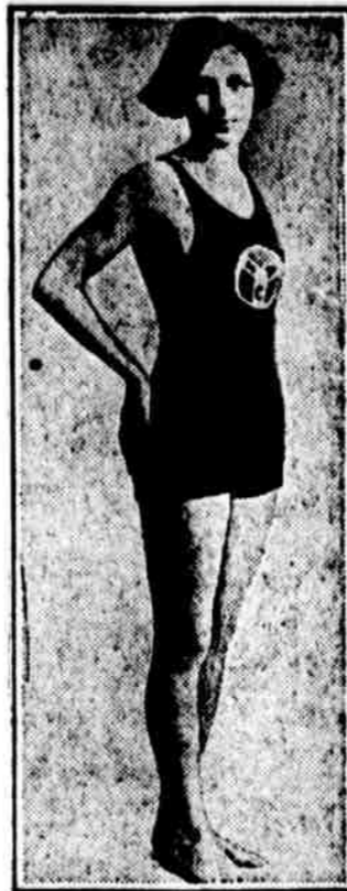
CHICAGO says that Sybil Bauer is the premier backstroke swimmer of the world