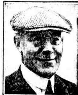
ON A HOLIDAY. Sir Auckland Geddes, English Ambassador, sails on the S. S. Mauretania