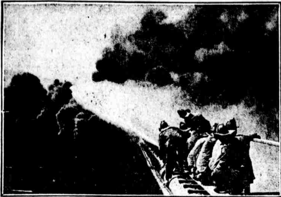
FIREMEN FIGHT BLAZE FOR TWENTY-THREE HOURS. A mysterious explosion near San Francisco ignited a tank which contained 55,000 barrels of crude oil