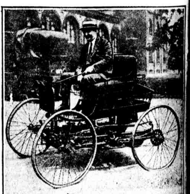
AMERICA'S FIRST AUTOMOBILE. It is on its way from the Smithsonian Institution to Kokomo, Ind., where it will repeat its original run, taken on July 4, 1884