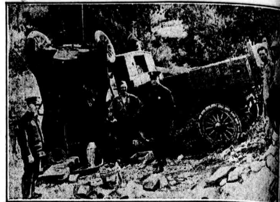
BOOZE FLOWS when police car is bumped off road. The Dallas (Tex.) police were returning from a raiding expedition when their car was struck by a truck. Three were injured