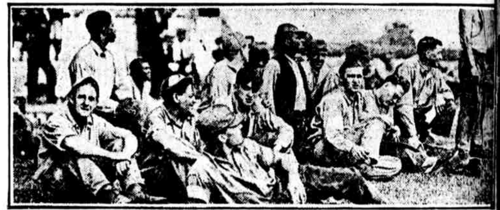
SOME OF THE ROOTERS. They found excellent "grandstand" seats and did a lot of high-class cheering while the F team played the G nine, in the House of Correction baseball league