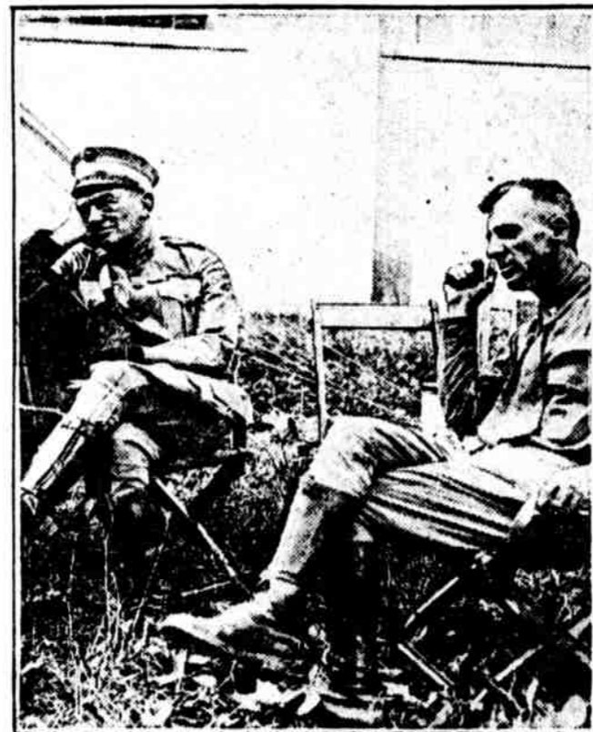
GENERAL LEJEUNE (left) and Brigadier General Butler were resting at Gettysburg after the long pilgrimage from Quantico, Va., when the camera clicked