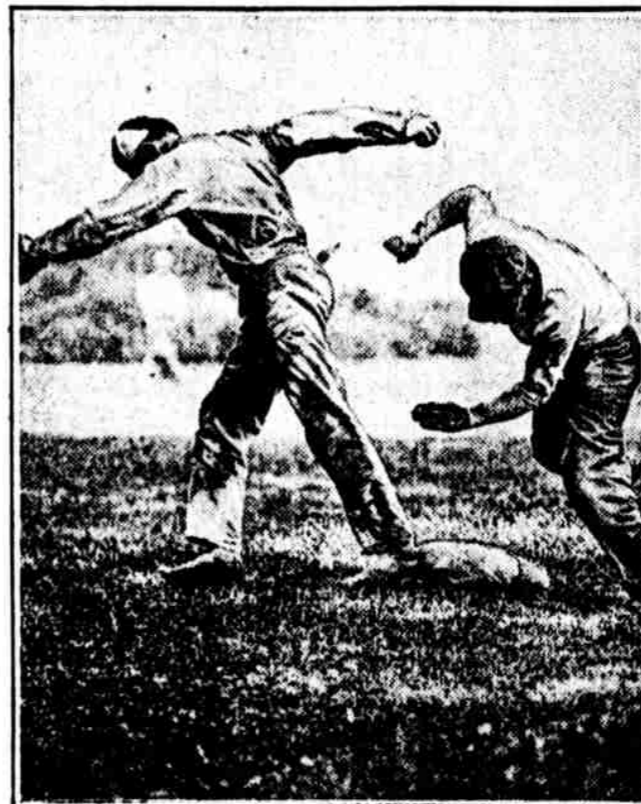
A RUNNER of the F team is safe when the ball is thrown wild by a G infielder in baseball game at the House of Correction