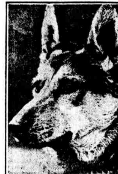
OBERCASSEL BAY was picked as Europe's best dog, at the International Alsatian Show in England