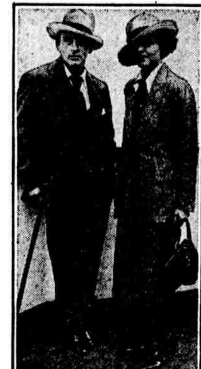
MRS. JOHN BARRYMORE, better known by her pen name, "Michael Strange," leaves for Europe