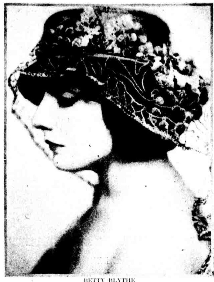
We will be glad to publish the pictures of such serven players as are suggested by the fans