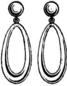
Fashionable earrings of 14-kt. green gold, per pair—$10.

THE WORLD IN A MIRROR The beautiful septa tones of the many places and events of the world, enhance the attractiveness of the only retrospective account published by any Philadelphia newspaper. It is a part of each Sunday's "Larson's." "Make it a Habit."—Ado.