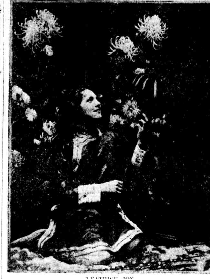
We will be glad to publish the pictures of such serven players as are