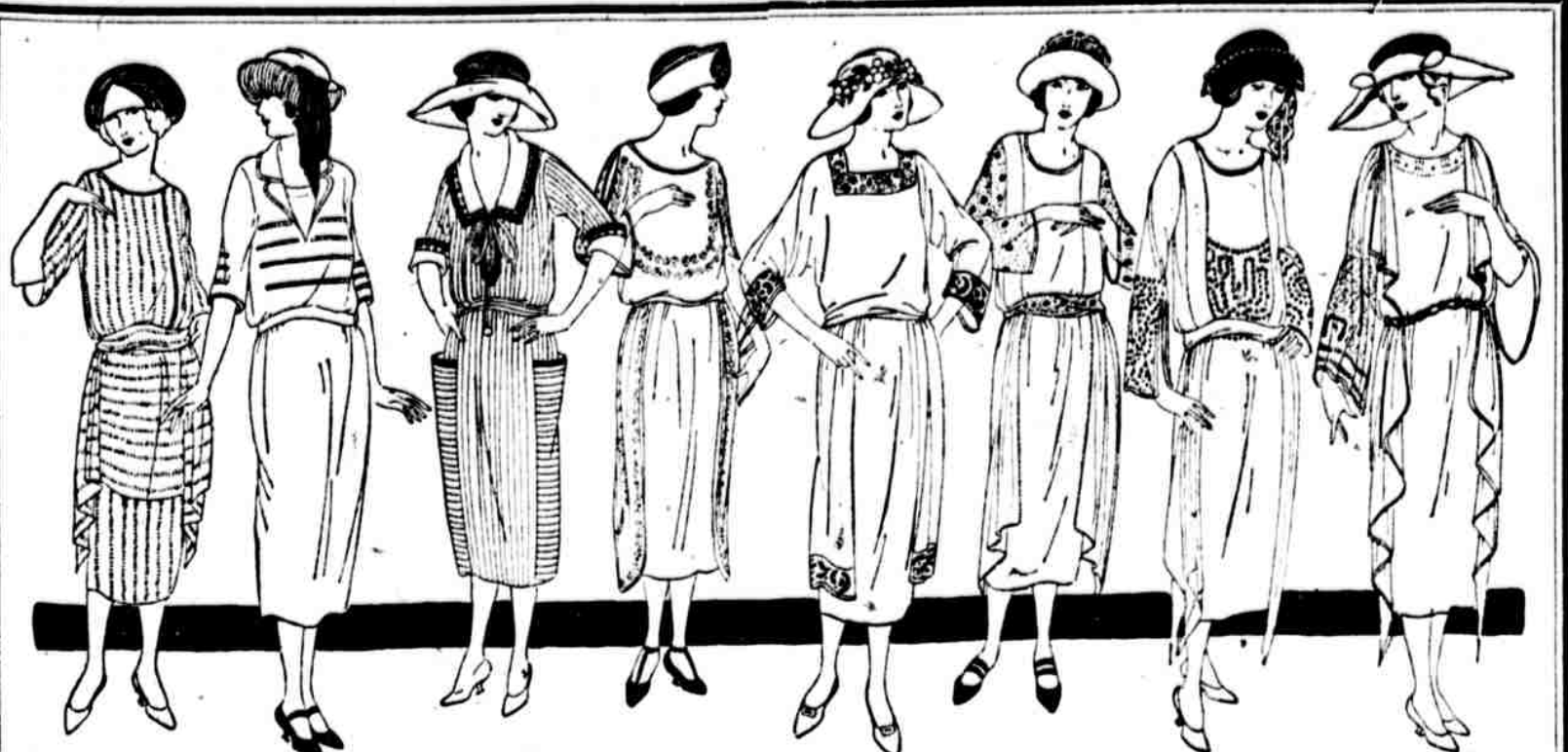
Tricolette $16.75 Linen $19.75 Gingham $22.50 Canton Crepe $10.00 Canton Crepe $50.00 Canton Crepe $50.00 Canton Crepe $67.50 Canton Crepe $67.50

It is only because we bought the entire surplus stock of the Alco factory that we can mark these Suits at such low prices. Suits of worsteds, serges and cassimeres, faultlessly tailored in styles for men and young men. Suits that were made to retail for ten to even twenty dollars more, are yours for $22.50 and $27.50, MONDAY.