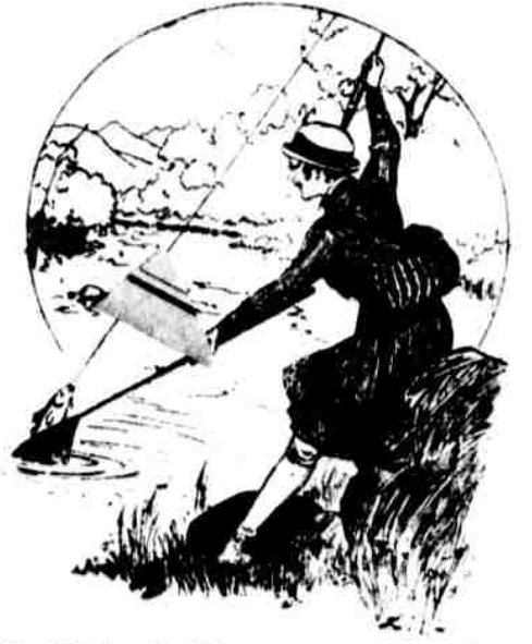
SPORT afield or in mountain stream sends many a Summer day speedily by.

Not a day goes by without a man calls upon it for service. It stands to reason that such a bathrobe must be light and cool, but it can be good looking as well. A faille bathrobe in dark colors—plain, striped or tinely figured, is priced $12. An all-silk twill bathrobe in plain colors is priced $18. (Main Floor)