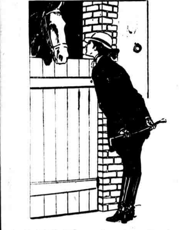
A CANTER on her favorite horse is the most important part of many a woman's holiday.

It is doubtful if there is another such collection of really good camp blankets. Every desirable size, grade and weight included. Famous Hudson Bay blankets, made in England for the cold Hudson Bay country, woven of heavy Russian wool and unequalled for warmth and protective qualities, size 72x90, weight 5 lbs., in gray and in tan colors, $13.50 each. Camp blankets, woven of Cape Colony wool, 68x84 inches, in gray and olive green, bound all around, $10 each. Camp blankets of good American wool, 5 lbs. in weight, size 68x84 inches, in gray, at $7. Camp blankets of Oregon wool, light gray, $6.75 each. Camp blankets of English wool, in brown and tan, size 60x80 inches, $5 each. Also some of the remarkably low-priced U. S. Army blankets, 66x84 inches, all-wool, at $3.65 each. (Sixth Floor)