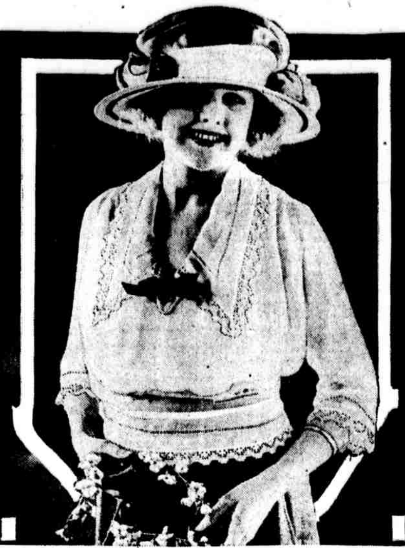
No tucking in around the waist is necessary with this dainty blouse of batiste, with its fine hemstitching and lace edging.