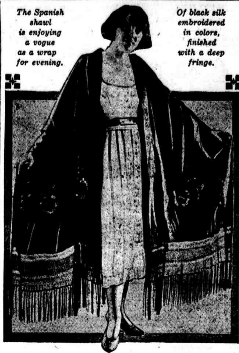
The Spanish shawl is enjoying a vogue as a wrap for evening.

Organdy is an excellent choice now as ever for the small belle's party dress, and it is particularly lovely when hand embroidered.