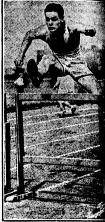
WON HIGH HURDLES. Sumner of Frankford, also crossed second in low hurdles