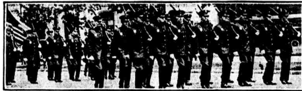
FIFTY MEN, graduates of the Philadelphia School for Policemen, equipped with guns, marched down the Parkway behind a mounted guard and police band, to the "graduation" exercises