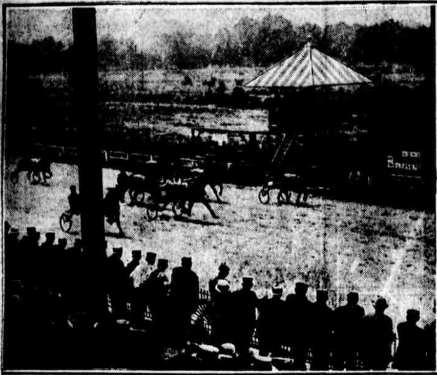
THEY'RE OFF? This was intended to be the start of a heat in the sweepstake at the Belmont Driving Park, Narberth, yesterday, but the starter called them back. They were soon off again in great style