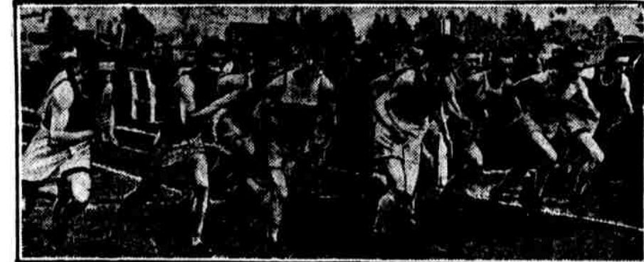
THERE WAS A BIG FIELD IN THE MILE RUN. The high school boys got started as the camera clicked