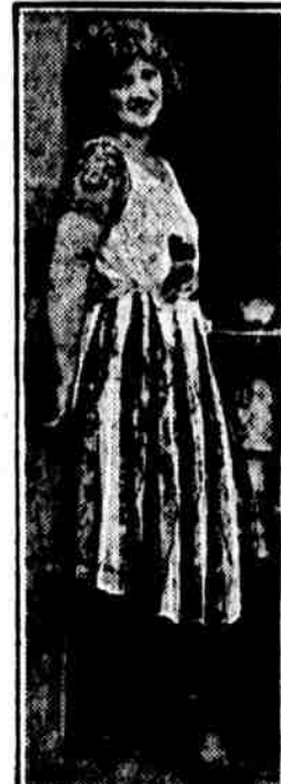
BACK FROM THE ORIENT. Mary Miles Minter is again in Hollywood