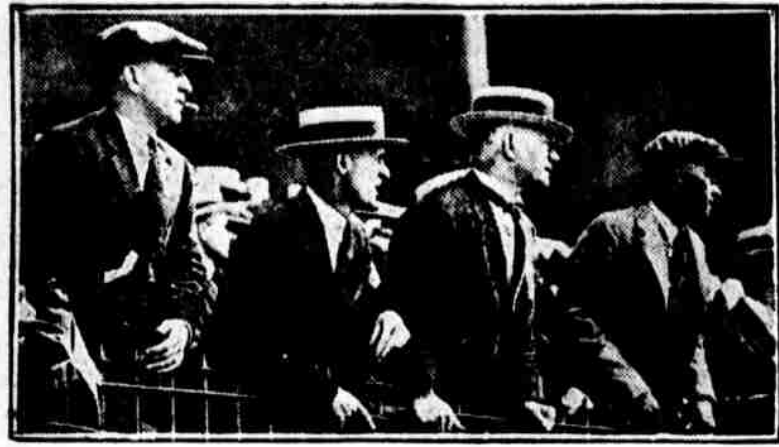
"NOW THEY'RE COMING." A few of the occupants of the grandstand as one of the races at the Belmont Driving Park, neared the finish