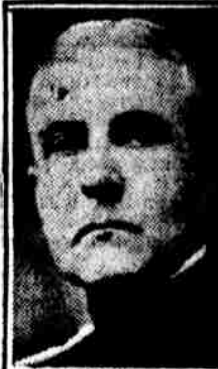
REAR ADMIRAL W. F. FULLAM is organizing air boards