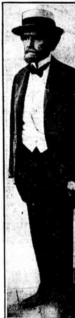
ON WAY TO FRANCE. Former U. S. Senator Clark, of Montana