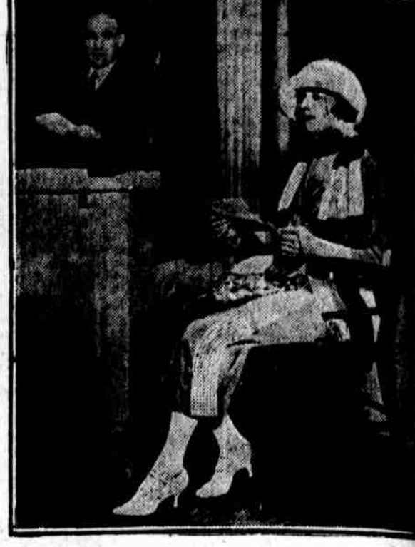
ON WITNESS STAND. Jean Acker, first wife of Rodolph Valentino, told her story as California court made inquiry into bigamy charges