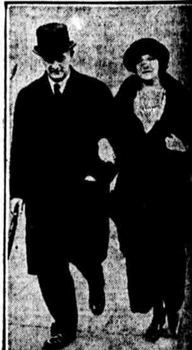
VISCOUNT AND VISCOUNTESS GREY. Viscount Grey recently married Lady Glenconner