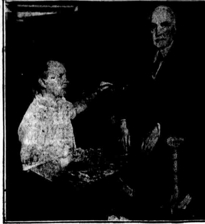
HOWARD CHANDLER CHRISTY, the artist, working on his portrait of President Harding. The sitting was at the White House