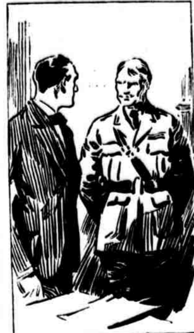
I used my official position to effect the escape of the prisoner and I arranged for her flight