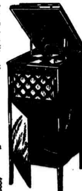
This Model $38

If you cannot promptly visit the Store won't you fill in and mail this Coupon.