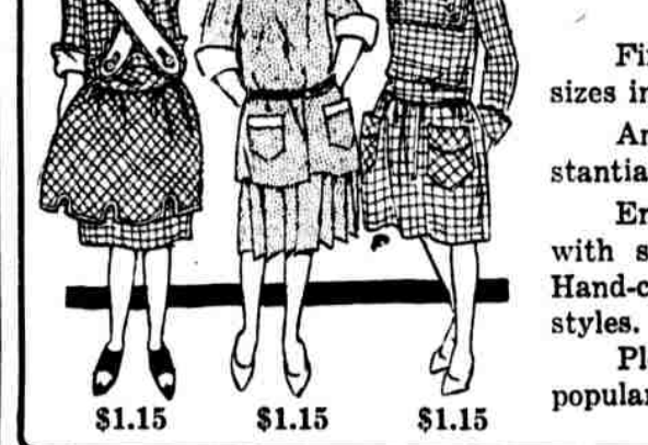
$1.15, $1.15, $1.15

Sale of Girls' Wonderful Gingham and Organdie Dresses at $1.15 Values $2 to $3