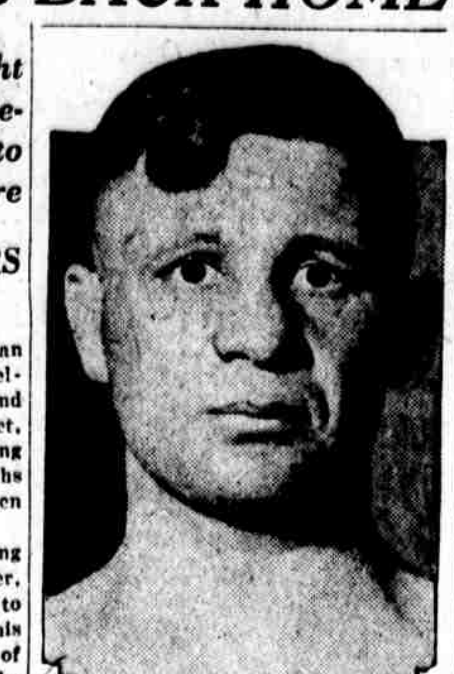
Philadelphia lad who was best doughboy boxer with American forces in Germany