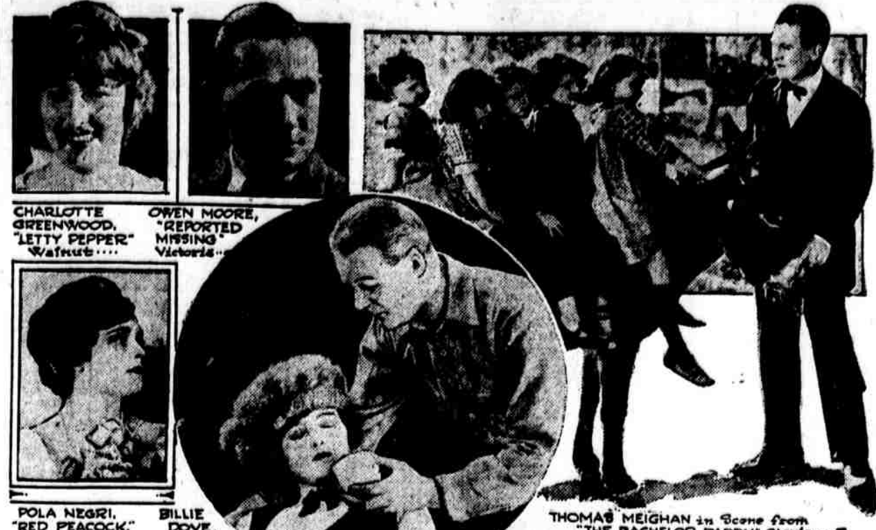
THOMAS MEIGHAN in Scene from "THE BACHELOR DADDY" Stanley.