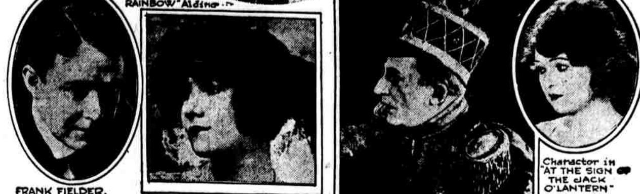
Character in "THE JACK O' LANTERN" Arcadia.