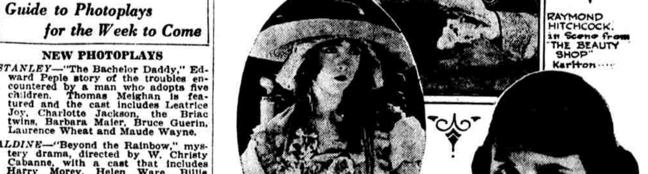
DOROTHY GISH, ORPHANS OF THE STORM, Palace.