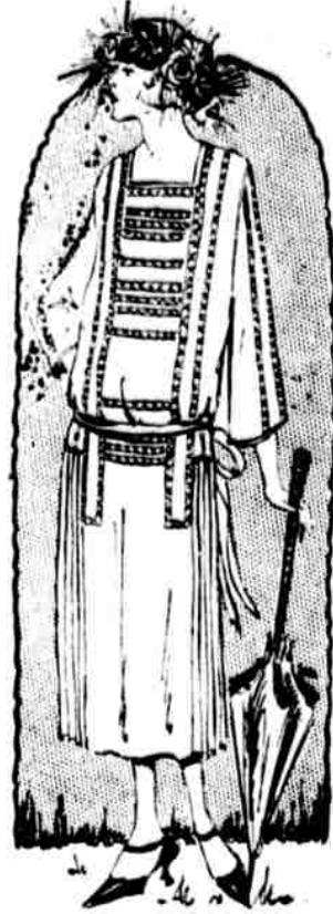
—Gimbels, Salons of Dress, Third floor.

At $65—Roma crepe—just simplicity—the way a diamond is "simple"! All-white and all-black. With the most graceful sleeves of all Paris! With the fluttering, narrow panels; with the most exquisite hand-embroidering; with great, great, nodding chrysanthemums. Sizes run gracefully up to graceful 44.