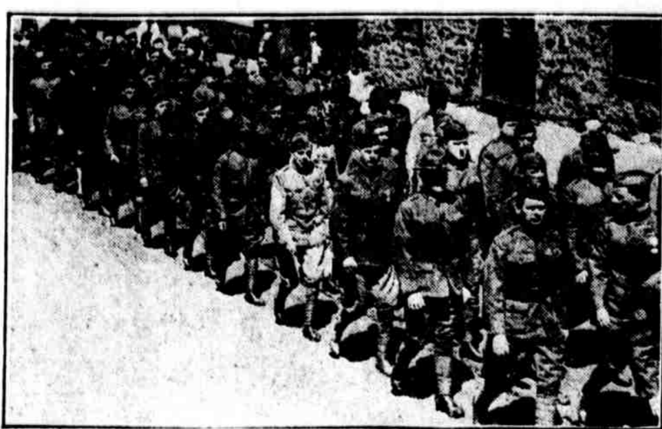
MEMBERS OF FRANKFORD POST, No. 211, American Legion, march in Frankford's Memorial Day parade. They are on their way to St. Joachim's Cemetery, where many graves were decorated