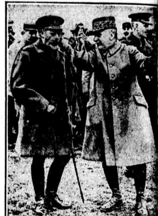
MARSHAL FOCH AS GUIDE. King George returns as the French warrior explains battle of Vimy Ridge