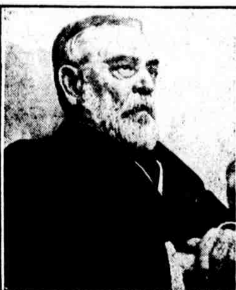
ROBERT T. LINCOLN, son of Abraham Lincoln, the emancipator, as he listened to President Harding's speech