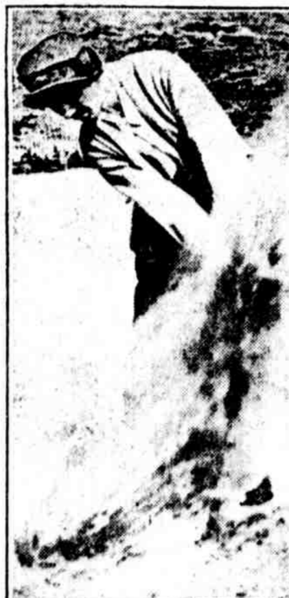
NEW CHAMP "BUNKERED." Miss Joyce Wethered, English golf champion, in difficulty