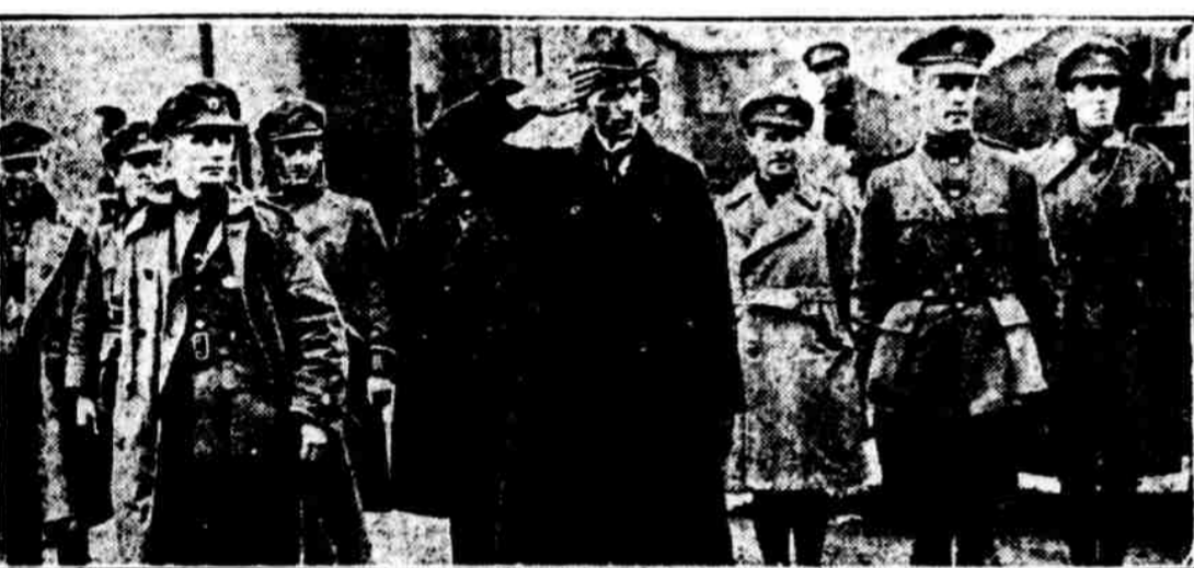
THE PORTOBELLO BARRACKS, in Dublin, being turned over to the Irish Free State troops. General O'Duffy, chief of staff, stands at salute, as the Irish troops pass him