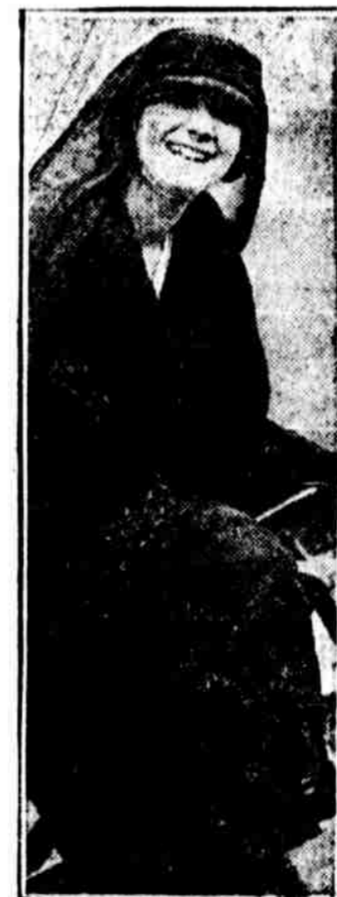
IT'S ALL TRUE. Miss Marilyn Miller, actress, admitted her engagement to Jack Pickford