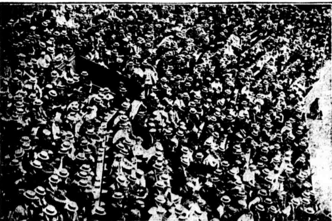
THEY SAW THE PHILLIES TAME THE GIANTS—and enjoyed it, too. Knights of the hard boards at Broad and Huntingdon streets, during the holiday baseball battle between Philadelphia and New York