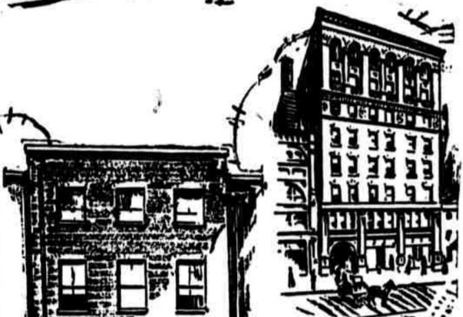
Wholesale and Mail Order Building