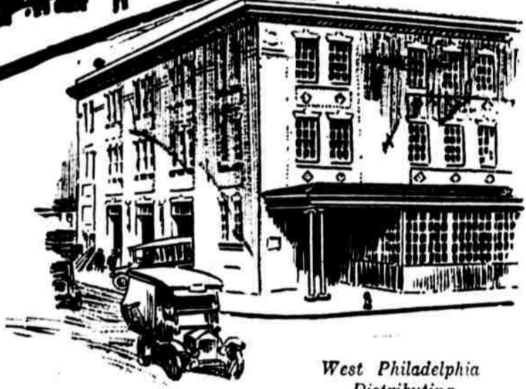
West Philadelphia Distributing Station

Nor does our duty to you, Store customers, stop with the gathering, selling and distributing of goods. Our obligations as merchants have not been fulfilled until you have been completely satisfied with the goods with which we have served you.