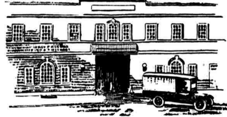
North Philadelphia Distributing Station