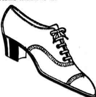
CANTILEVER SHOE SHOP 1300 Walnut Street Over Cunard Office

is a flexible arch shoe. In it the foot has perfect freedom: is correctly supported; the toes are not cramped. The Cantilever Shoe has natural lines—it fits the foot. There is no pinching here; no unnecessary room there. Cantilever Shoes have the medium Meel which gives poise to the body and keeps the feet from tiring easily. The rounded toe of Cantilevers is now the vogue. Up-to-date women everywhere wear them for all daytime occasions—whether business or social. Step into one of the stores below and let him fit you to a pair. Widths AAAAA to E.