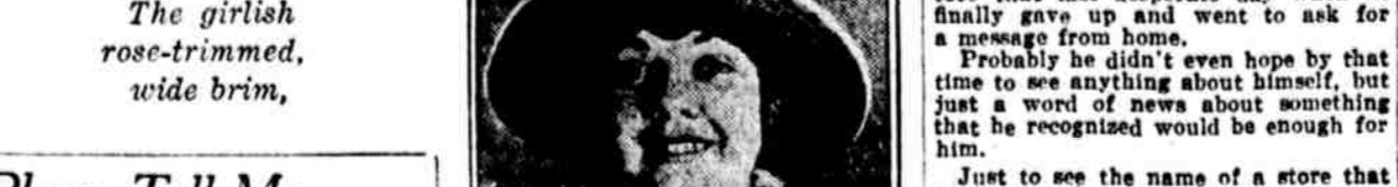
The girlish rose-trimmed, wide brim, the dark straw for sports, the chic toque

THE man who tells "your home paper" was telling of some of his experiences. And one of them concerned a runaway boy of fourteen.