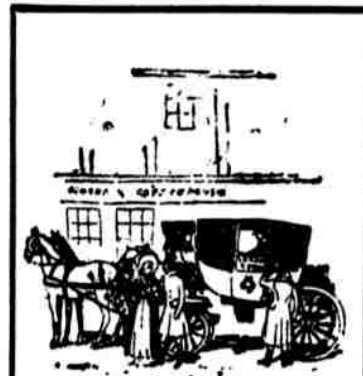
The Women's London Shop

In colors there are blue and black, of course, also burro, Malay brown, Sorrento, dolphin-gray and fallow. Prices start at $95 and go up to $145.