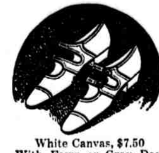
With Fawn or Gray Deer Saddle, $8.50