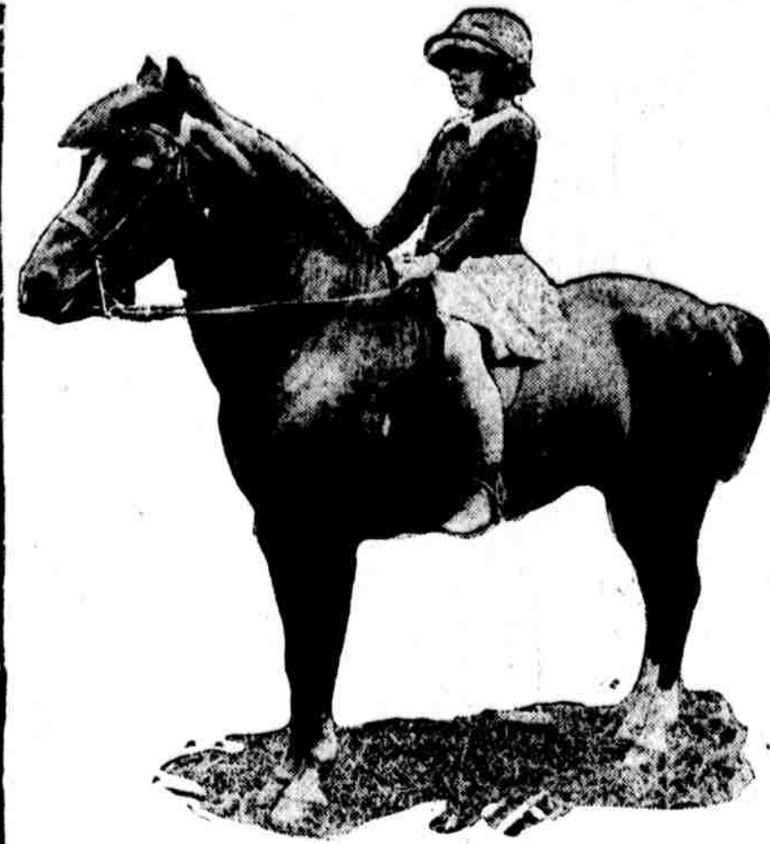
BLUE RIBBON WINNER. Sidney Sharp was a busy little lady during the pony and dog show in Wynnewood yesterday. The judges picked her Ginger Ale as the best of one of the many classes