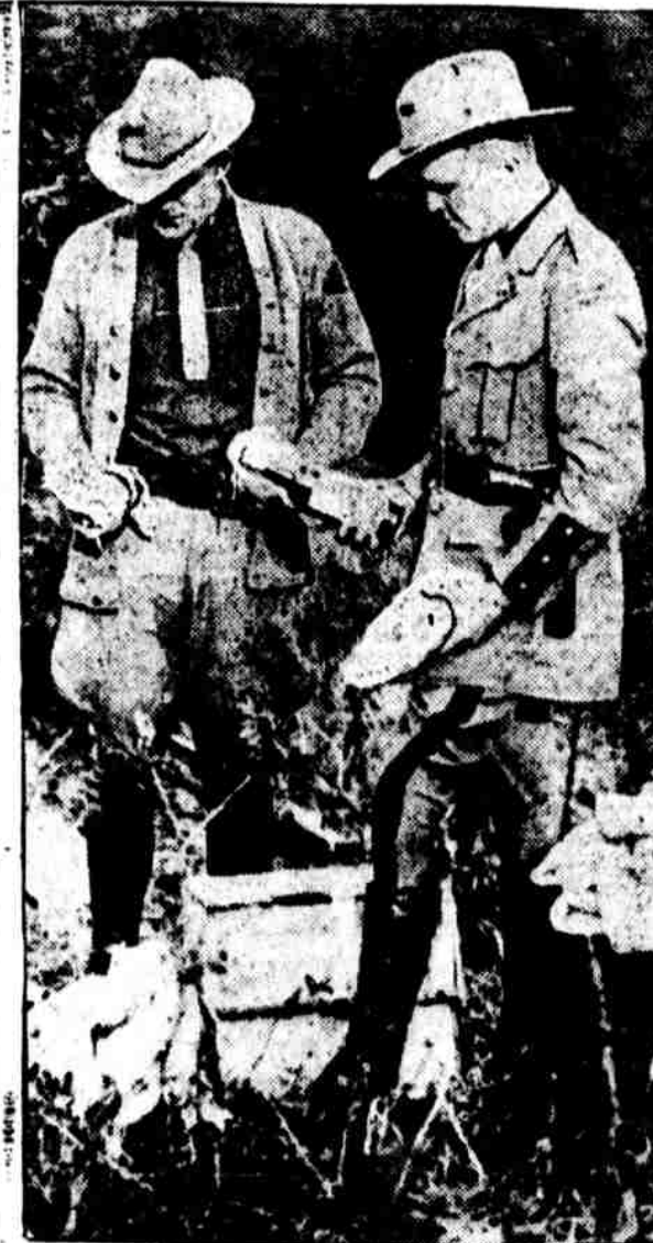
AERIAL RUM RUNNER CRASHES IN NEW YORK STATE. This big airplane came to grief on a farm near Croton. When the farmer arrived he found the machine laden with Scotch and Irish whisky. The aviators escaped. State police believe that the plane was used in running liquor from Canada. They are examining the contraband